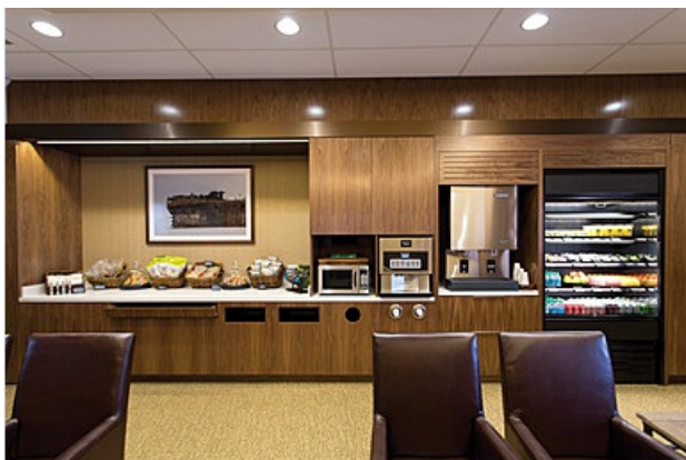
FS Lanai airport lounge at Honolulu International Airport

The lounge greets guests as they disembark from their planes before they are taken to the property. For hospitality brands that strive to curate a guest's stay, an airport lounge will ensure that the property starts off on the right foot ( see story ).