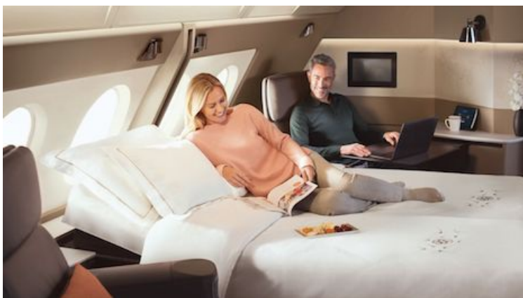
Suite on Singapore Airlines' A380.

Creating a private travel experience in the sky, Singapore Airlines has first class suites in its Airbus A380 fleet. Located in the front of the cabin on the upper deck, Singapore Airlines' suites feature a full-flat bed with an adjustable recline, which can be stowed completely to allow for extra space. Additionally, couples traveling can turn the beds in the first two suites in each aisle into double beds ( see story ).