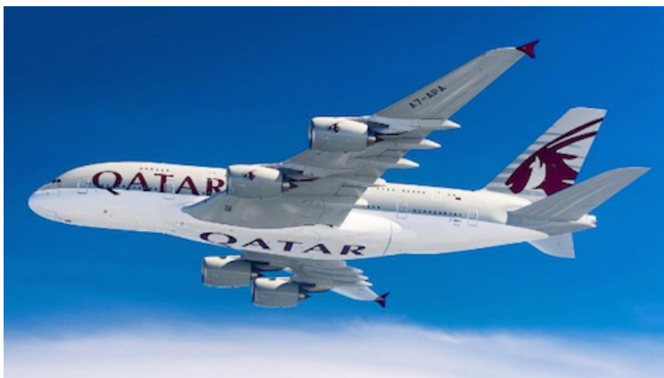
Qatar Airways plane 465

Similarly, Qatar Airways bet it big on business class reinventing the cabin with double beds in its Boeing 777 and A350 planes. Qatar's risk is unprecedented in the world of its competitors, such as Etihad or Emirates, where the focus on first class is still prevalent.