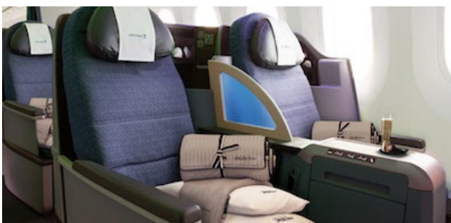
Unite Polaris Saks bedding

In December 2016, United debuted its Polaris cabin. The front of the airline's widebody fleet has been outfitted with individual "pods," which give each flyer access to the aisle with custom seats that can be transitioned to a 6.5-foot-long flatbed.