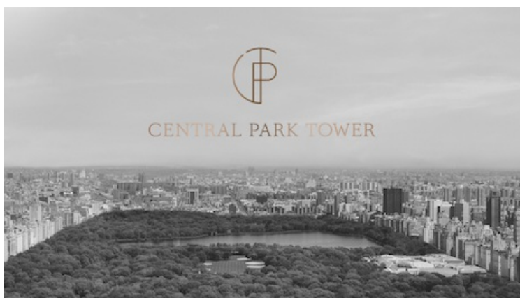
Central Park Tower Web site

Even more new buildings are making their own impressions on the ultra-wealthy. For example, real estate developer Extell Development Company has secured a $1.135 billion financing package for the construction of a residential tower on Billionaires' Row in New York.