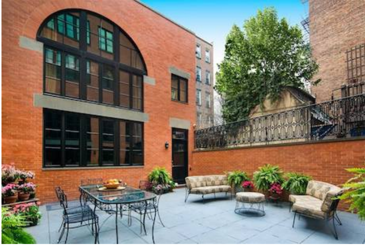
Townhouse in New York City

The townhouse market in New York saw record prices set in 2015, but fell short of that in 2017. However, inventory numbers continue to remain low, marking the second lowest on record ( see story ).