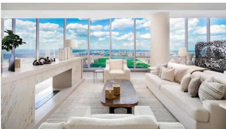
One57 condo Sotheby's Realty 465

According to the Douglas Elliman 2017 Manhattan Townhouse Decade Sales Report , from 2008 to 2017 negotiability became more flexible in New York luxury real estate, resulting in a decline in on-the-market time. The average sales price in the past 10 years in luxury was reported as $20,382,189.