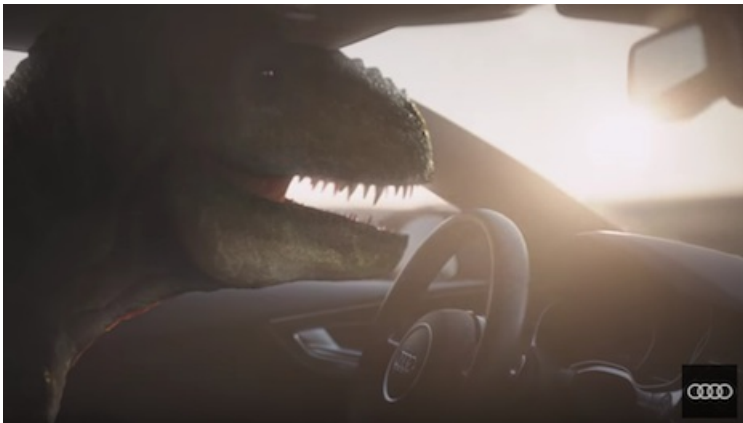
Audi's humorous autonomous car commercial.

While the investigation is still ongoing as to whether it was the fault of the driverless car, which had a safety driver sitting behind the wheel but was in autopilot mode, it would be the first instance of a death caused by an autonomous vehicle.