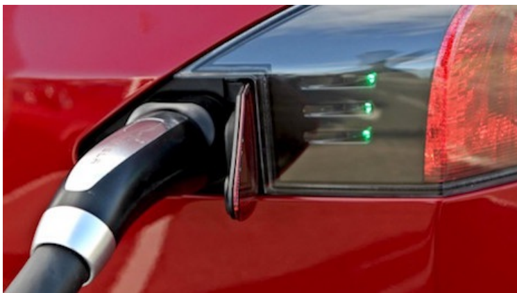
Charging port of a Tesla Model S

For example, The Ritz Carlton Hotel Company bolstered a sustainable future with the addition of electric vehicle charging stations at properties across its global portfolio.