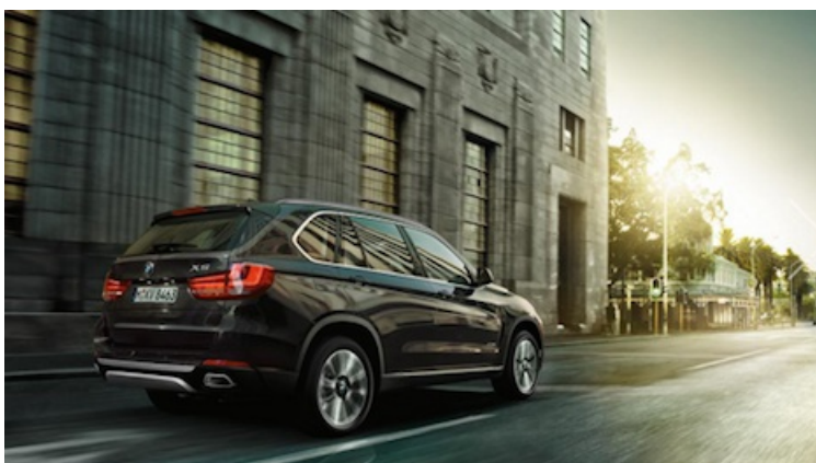
BMW's X5 series is thought to be environmentally friendly.

BMW X5 Diesels, in production from 2009 to 2013, and the BMW 335d from 2009 to 2011, are being cited in a lawsuit against the automaker for emissions well beyond the legal limit.