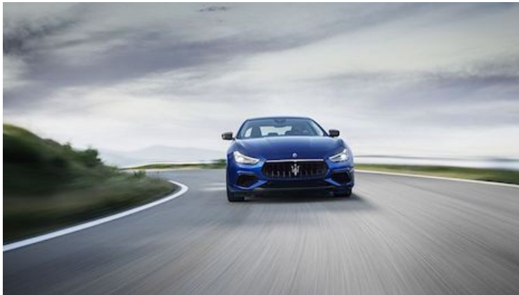
Maserati's Ghibli.