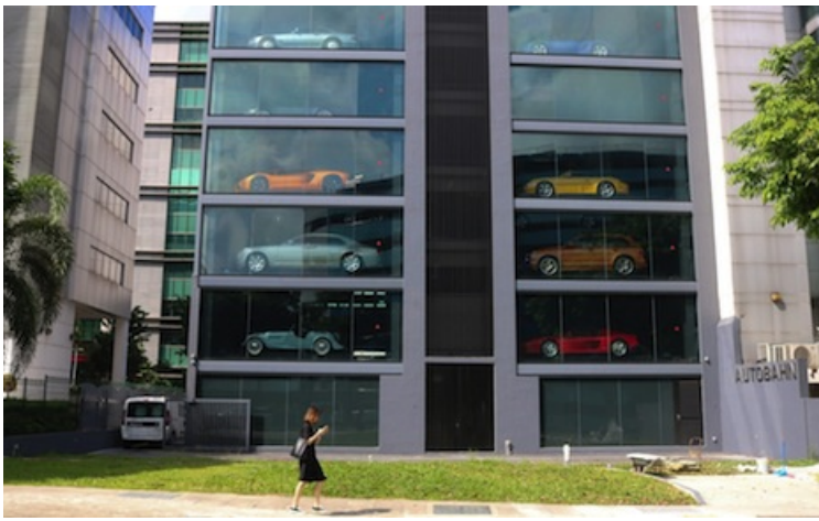
Current Singapore vending machine