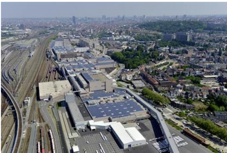
Audi's Brussels plant uses solar energy.

Audi, a VW subsidiary, also is looking to reduce its carbon footprint with the opening of the first CO2-neutral production plant in the premium segment.