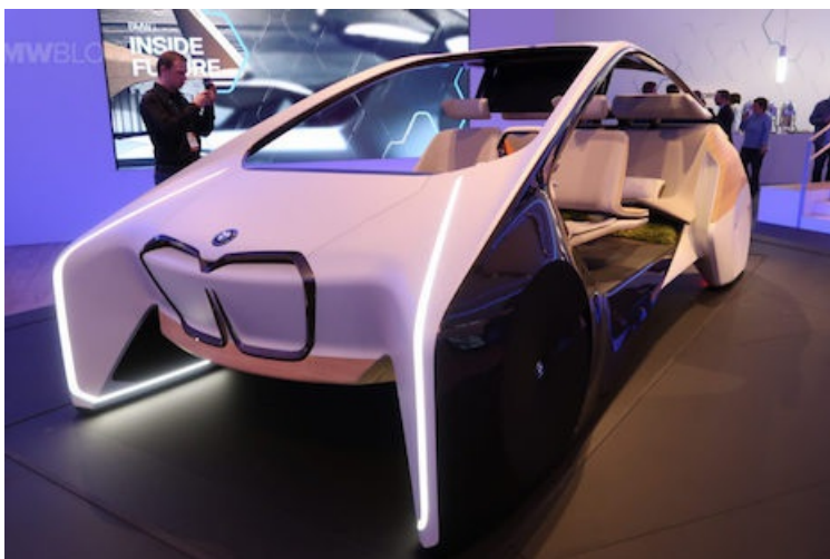
BMW's installation at CES for its HoloActive Touch System.

BMW took the technology one step further, eliminating all senses. The automaker revealed a new driver interface for its cars of the future in which consumers can control their vehicles by touching the air. BMW's HoloActive Touch System is its concept for a future operating platform that exists in a hologram-like form, using cameras and motion sensors to interact with drivers ( see story ).