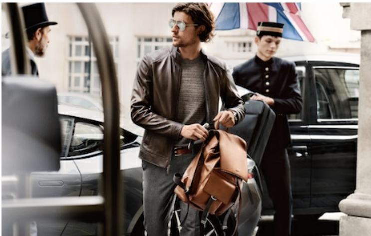
Michael Kors menswear.

A few months prior to the opening of Burberry's revamped store, Michael Kors increased the emphasis on its menswear with the opening of its largest store worldwide in SoHo. The location at 520 Broadway gives Michael Kors the opportunity to test new retail concepts for potential expansion ( see story ).