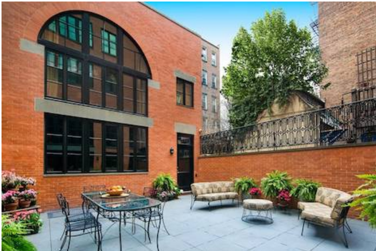
Townhouse listing in the New York.

As for 2018, CityRealty's report predicts that the city will see a slight decline for the first time since the 2009 global recession.