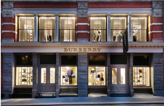
Burberry SoHo storefront

Housed in a landmark building in SoHo's Cast Iron District that is listed on the National Register of Historic Places, the boutique features two new entrances and has been expanded to include a second floor ( see story ).