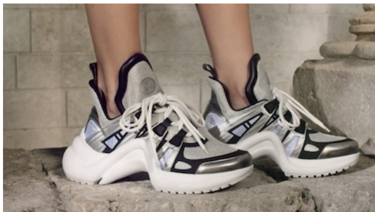
Louis Vuitton's Archlight sneakers for women's spring/summer 2018.

This past winter, Louis Vuitton explored wardrobe items that transcend time in a pop-up in New York's SoHo neighborhood.