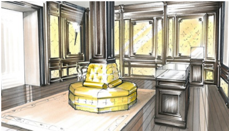
Patek Philippe's Napoleon Room takes inspiration from its salon and includes views of Lake Geneva.

Luxury houses often host exhibits that either offer insight into the brand's past or host a connection between the company and consumers. These exhibits provide a space for visitors and tourists to interact with the brand without necessarily purchasing.