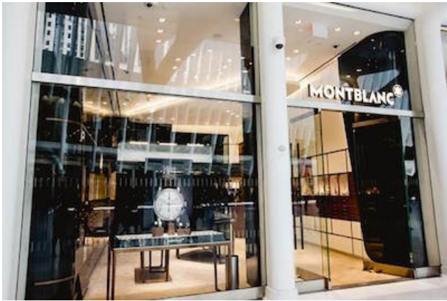
Montblanc storefront at Westfield World Trade Center, New York

The watchmaker's boutique pays homage to the brand's heritage as a maker of writing instruments, timepieces, leather goods and men's accessories and jewelry. Identified as New York's latest landmark, Westfield World Trade Center is already being penned as "the new port of entry to Lower Manhattan," as the area will benefit from nearly 16 million passersby per year ( see story ).