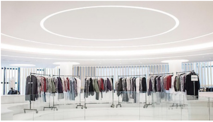
Inside Saks Downtown

The 86,000-square-foot store is an anchor within the shopping center. This is the first in a series of planned renovations and openings for Saks in the New York metro area in the next few years as the retailer looks to further cement its position in its hometown ( see story ).