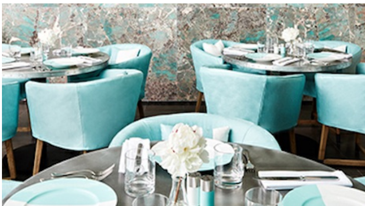
Tiffany Blue Box Cafe

Located on the newly renovated fourth floor of its New York store, Tiffany's Blue Box Cafe is the first retail dining concept envisioned by the jeweler. The fourth floor also houses Tiffany's new Home & Accessories collection of elevated everyday objects, its baby boutique, a collection of vintage books curated by Assouline as well as an area dedicated to the jeweler's fragrance ( see story ).