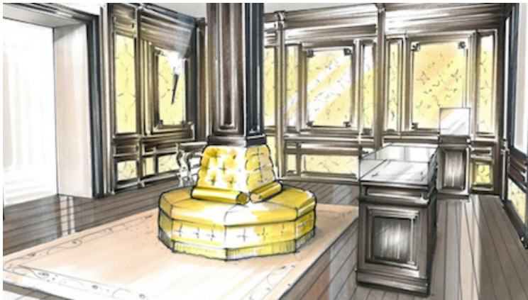
Patek Philippe's Napoleon Room takes inspiration from its salon and includes views of Lake Geneva.

Luxury houses often host exhibits that either offer insight into the brand's past or host a connection between the company and consumers. These exhibits provide a space for visitors and tourists to interact with the brand without necessarily purchasing.