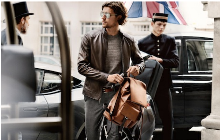
Michael Kors menswear.

A few months prior to the opening of Burberry's revamped store, Michael Kors increased the emphasis on its menswear with the opening of its largest store worldwide in SoHo. The location at 520 Broadway gives Michael Kors the opportunity to test new retail concepts for potential expansion ( see story ).