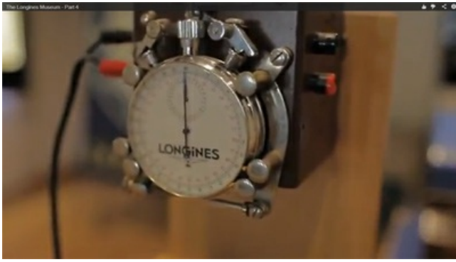
Longines Museum video still

Travelling out of Switzerland to Germany, the Glashütte Museum is housed in the historic watchmaking school of the brand. The history of the brand is presented in chronological order with a multimedia approach.