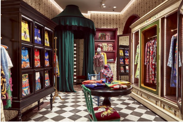
Gucci Garden Galleria, Guccification exhibit.

Gucci describes Gucci Garden as a lively, interactive experience rather than just a rich archive. Instead of simply a display of historic pieces in a permanent collection, Gucci Garden aims to collide past with present.