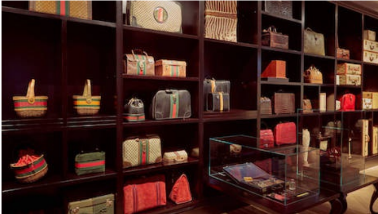
Gucci Garden opened in Florence, Italy earlier this year.