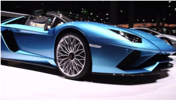
Lamborghini's new Aventador S Roadster

For example, the Lamborghini Museum in Sant'Agata Bolognese, Italy hosts both vintage and concept cars, as well as a production line tour and numerous events.