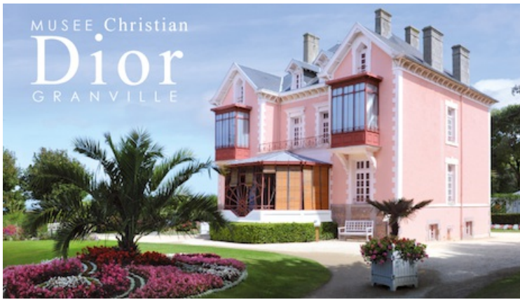
Christian Dior Museum in Granville, Normandy, France

Similarly, the Christian Dior museum in Granville in France's Normandy region offers a dedication to the fashion designer and is aptly placed in his childhood home, Les Rhumbs.