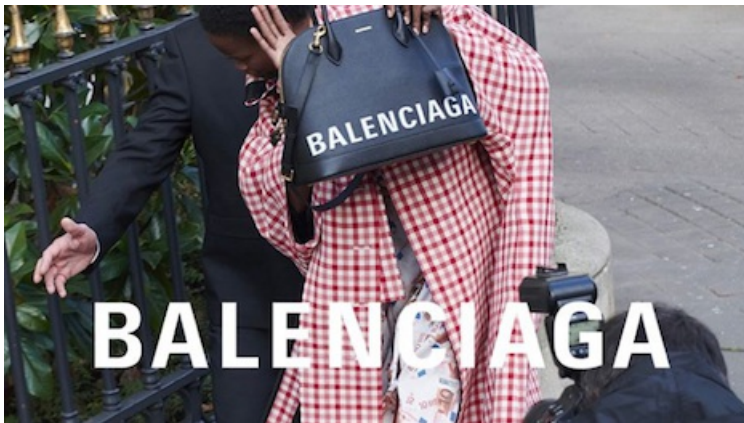
Balenciaga spring/summer 2018 campaign.

This exhibition space opened after a traveling exhibition returned to Spain following stops worldwide.