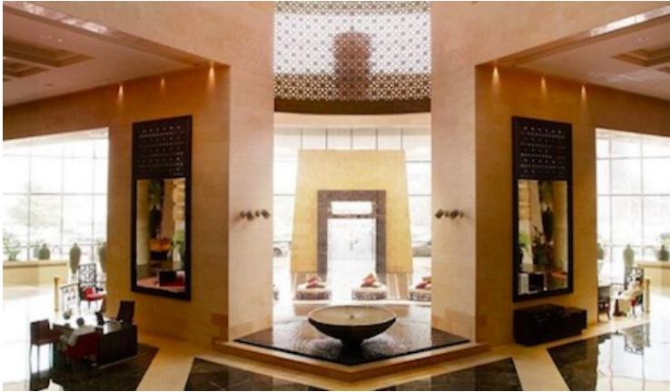
Raffles Hotels & Resorts strive for excellence.