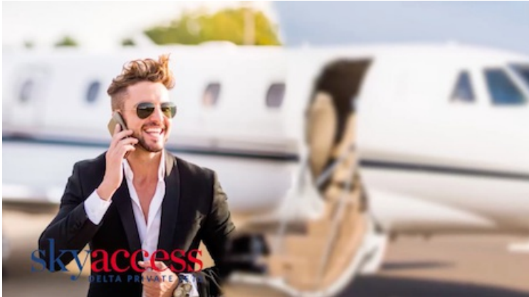
Delta Private Jets looks to make finding empty leg flights easier.