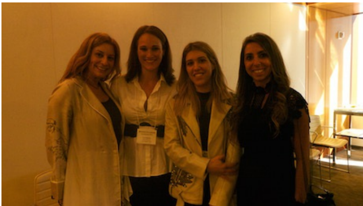
After the event