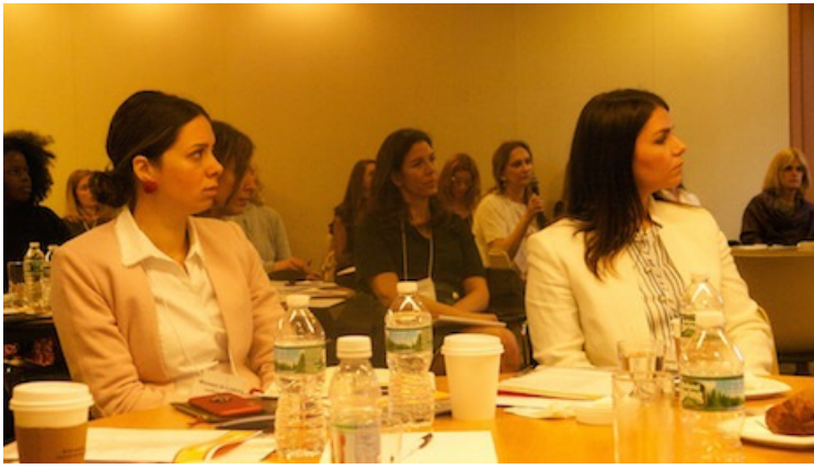
Attendees listening to a presenter