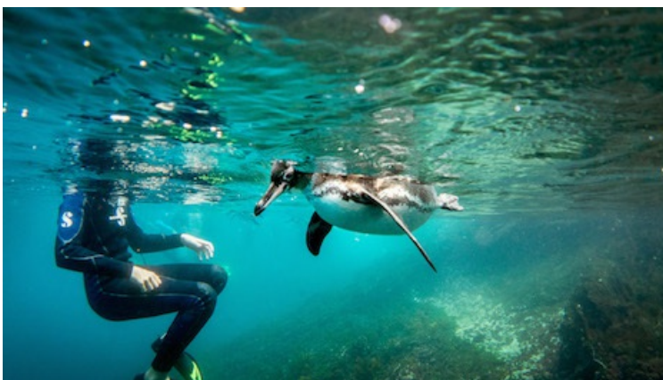
Galapagos penguins seen while snorkeling in the waters off Tangus Cove.

Four Seasons has also arranged a traditional Moroccan lunch with a local family in Marrakech. Private salsa dance lessons will also be available in Bogota, as will a three-night cruise in the Galapagos Islands.