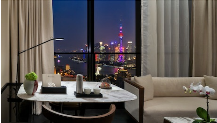
Bulgari Hotels & Resorts Shanghai location.