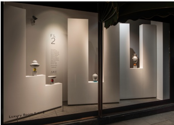
Wedgwood x Lee Broom for Harrods' Art Partners.

The retailer's Art Partners saw its Brompton Road windows reimaged with artistically inspired displays. For Art Partners, some of luxury's finest home furnishings brands worked with acclaimed artists and designers to showcase how the two industries can intersect.