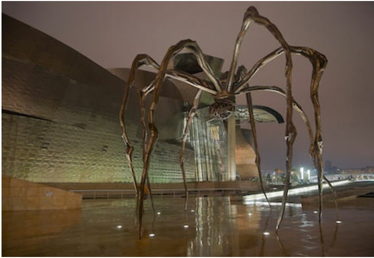
Ms. Bourgeois' famous Maman sculpture.

For example, Barneys New York brought together art and fashion in a window display combining the work of artist Louise Bourgeois and designer Rei Kawakubo of Comme des Garçons.