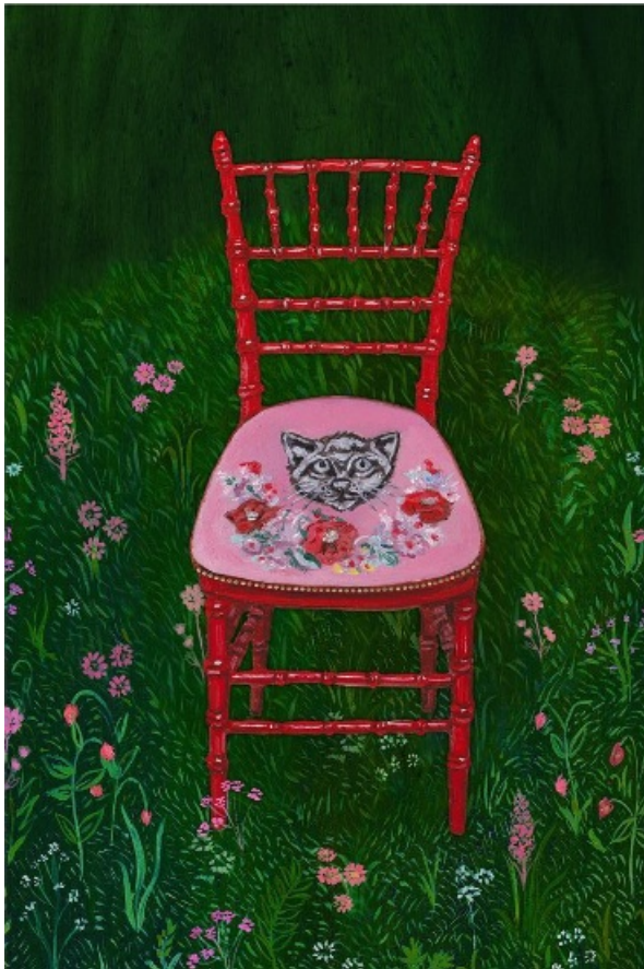
Gucci Decor chair.

The Gucci Dcor line brought the codes, patterns and motifs that artistic director Alessandro Michele established since taking the helm in 2015 to a new category, ranging from furniture and furnishings to crockery. Gucci Dcor debuted in September 2017, with the Bergdorf Goodman shop-in-shop coinciding with New York Fashion Week.