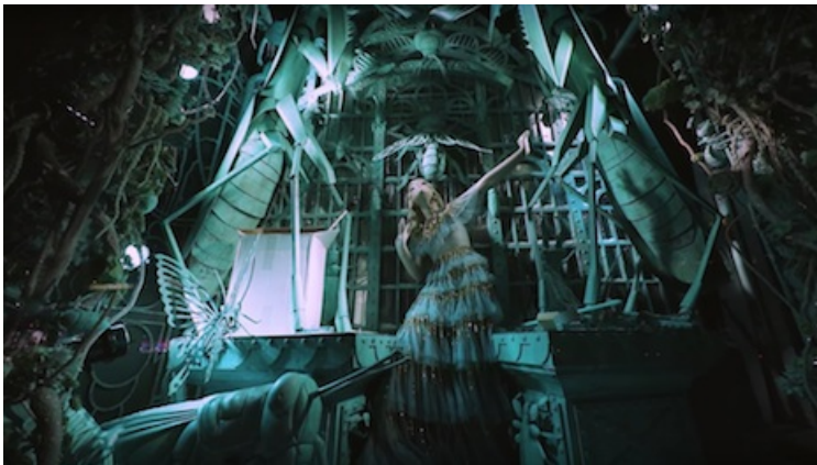
Bergdorf Goodman holiday window display from 2016.

The retailer's "To New York With Love" display paid homage to local institutions such as the New York Philharmonic and the New York Botanical Garden.