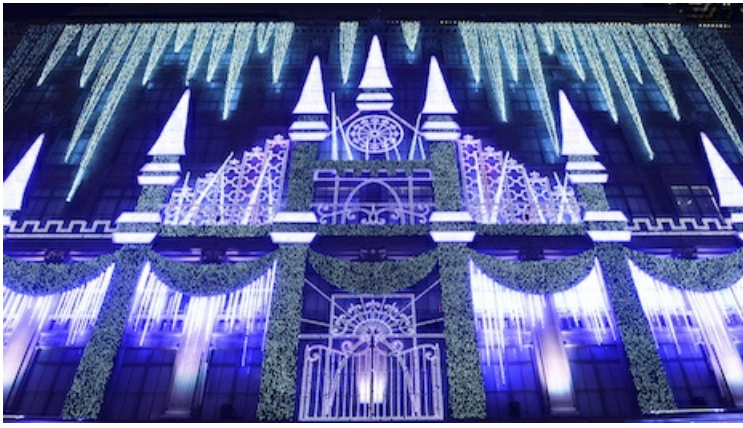
Saks Fifth Avenue light show in 2016.

Saks' decor for Land of 1,000 Delights included jumbo swirl lollipops, whipped cotton candy and mounds of rock candy. These sweet visualizations were placed through each store's displays to create an irresistible destination for the holiday season.