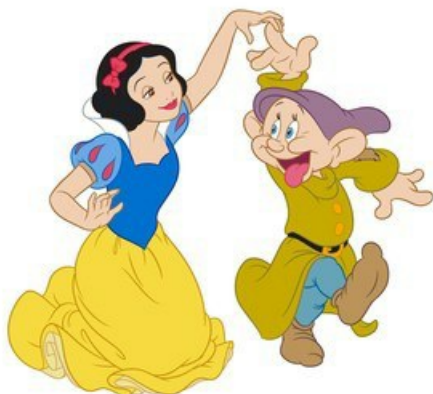
Snow White and Dopey.

The retailer's "Once Upon a Holiday" campaign featured window displays that recreated the feeling of the film through animation, custom gowns and art. Commemorating the movie's 80th anniversary, Saks' campaign leaned on Disney magic to inspire shoppers of all ages.