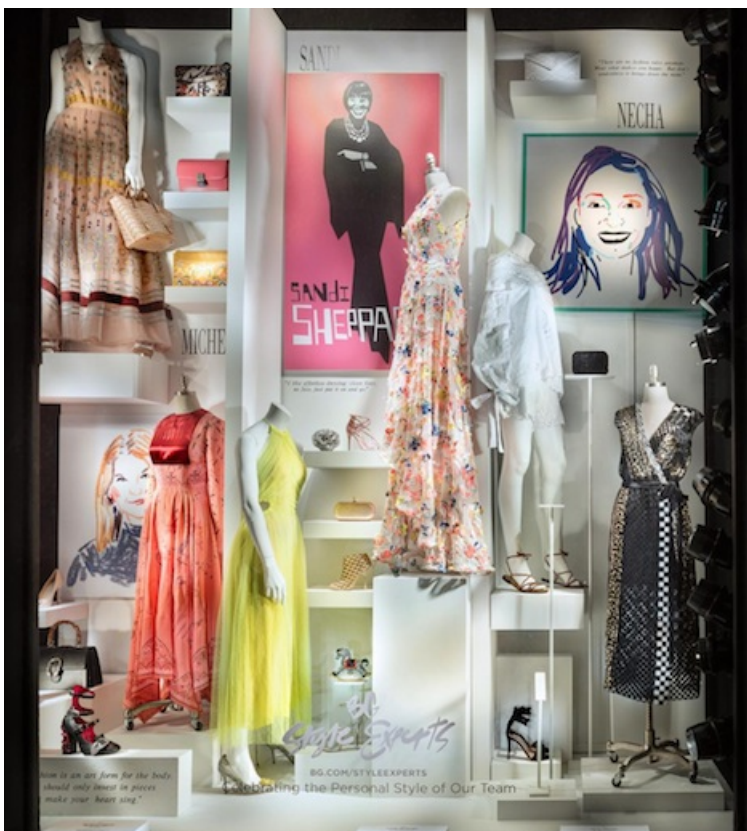
BG Style Experts window display at Bergdorf Goodman.

The department store invited 25 of its sales associates, both from its men's and women's wear stores, to style its legendary windows. Part of "BG Style Experts," the department store's spring campaign, the effort also included social media activations, in-store displays and editorialized content featured in Bergdorf Goodman magazine, in print and online.