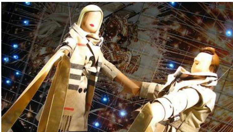
Burberry figurines for Printemps' 2015 holiday display.

the theatrical displays may have helped Printemps make a larger impact for its chosen cause.