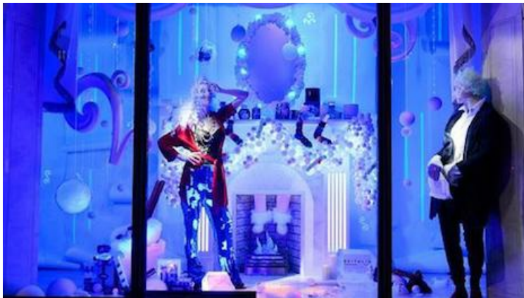
Harvey Nichols' 2016 holiday windows.