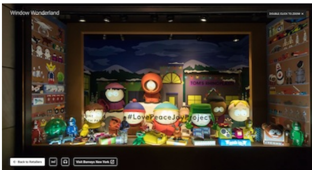
Barneys Window Wonderland.

"Window Wonderland" recreated the feeling of strolling outside iconic retailers on a consumer's desktop computer, mobile phone or tablet. While about 5 million tourists descend on New York over the holiday season, many consumers based in other cities, states or countries will not be able to get to see these in person, making this Google experience the next best thing.