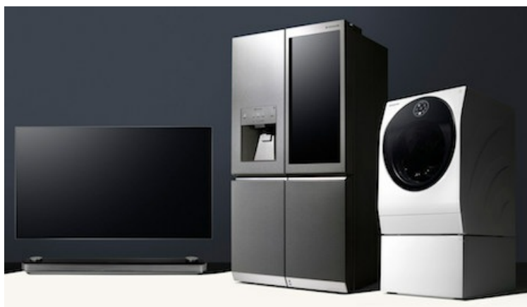
LG appliances.

Another way to link digital with traditional is to team up with a technology brand. For example, department store chain Bloomingdale's linked with electronics label LG Signature for a window display that combined technology and fashion.