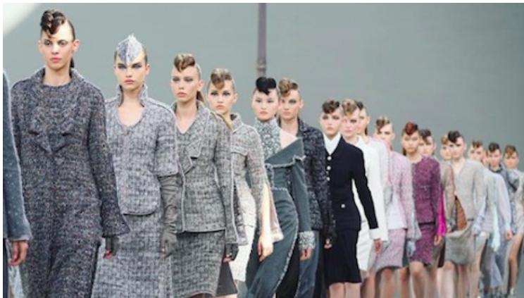
Chanel's Haute Couture show.