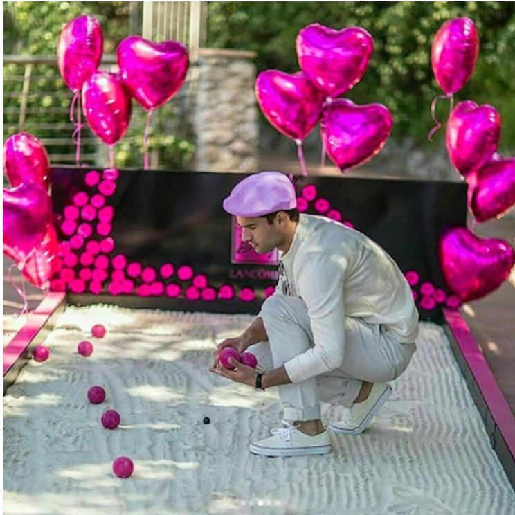
Lancme brought influencers to the South of France.

For instance, Lancme invited a handful of influencers to the Cte d'Azur in search of Monsieur Big, sharing clues as to the character's whereabouts and personality in a string of Instagram posts. In addition to Lancme's official content, many of the women also shared their impressions from the event, expanding the audience for the campaign ( see story ).