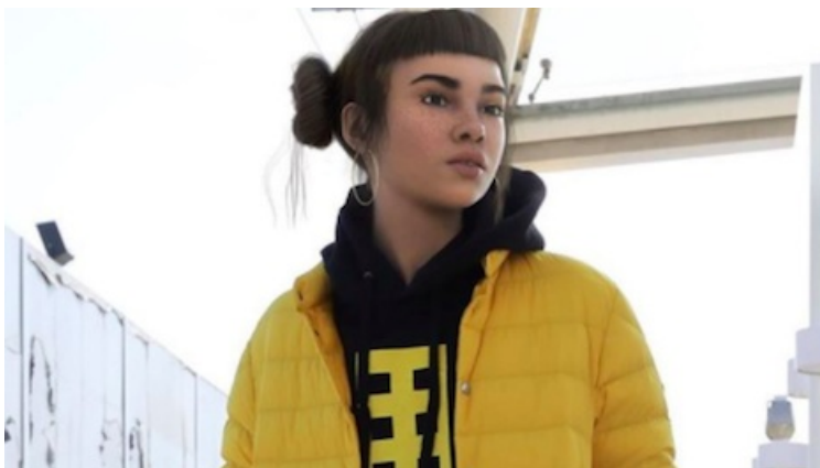
Moncler tapped Lil Miquela for its Genius effort.

In addition to seeking out more niche partners, brands have been branching out into new forms of influencers.