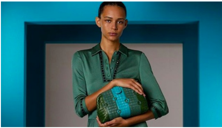
Bottega Veneta opts for logo-less luxury.