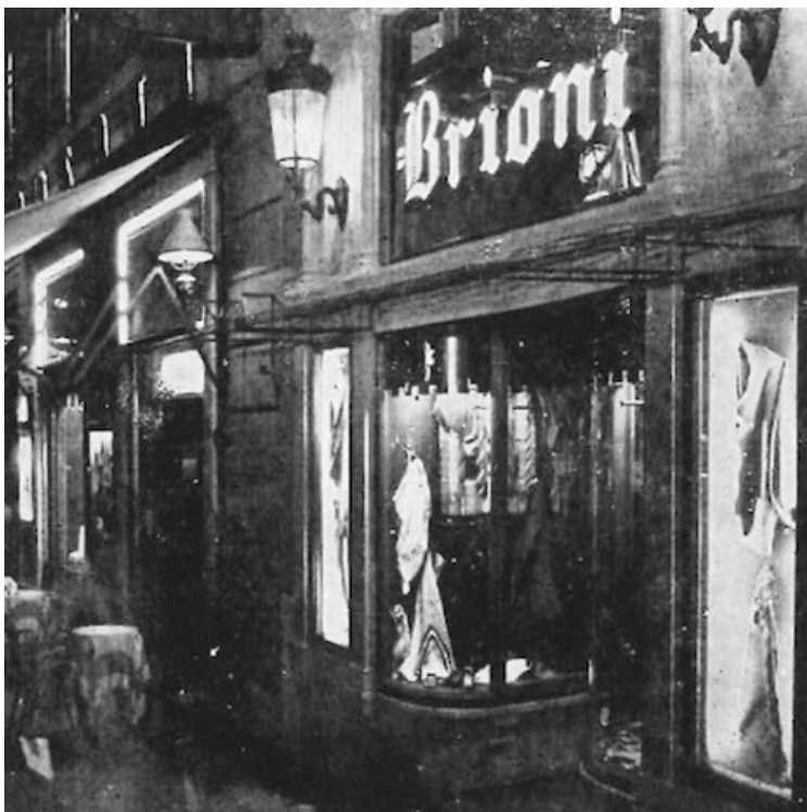
A Brioni boutique from 1945 included a gothic font on its facade.

As part of Brioni's edgier makeover courtesy of former creative director Justin O'Shea, the brand's logo was fashioned in a gothic font. While some were skeptical of the "new" typeface, it was actually inspired by an old typeface the brand used in the early 20th century.