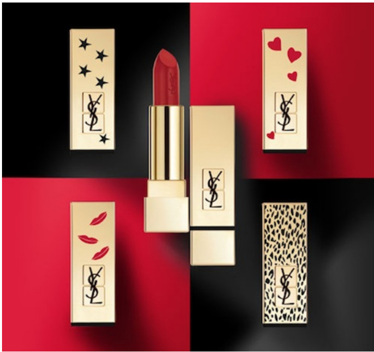
Cosmetics often feature a brand's logo.

Logoed items are also attractive to counterfeiters, who create faux versions of Chanel's interlocking C's or Louis Vuitton's monogram.