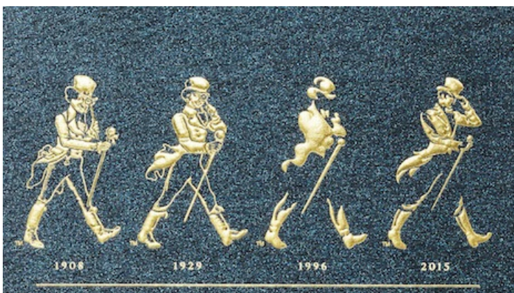
Johnnie Walker Blue Label Striding Man Edition packaging.

For instance, Scotch whisky-maker Johnnie Walker created a retrospective on more than a century of its brand history through the medium of bottles.