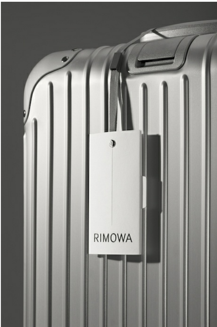
Rimowa updated its logo earlier this year.

German luggage manufacturer Rimowa similarly launched a new brand identity as it readied to celebrate 120 years in business.