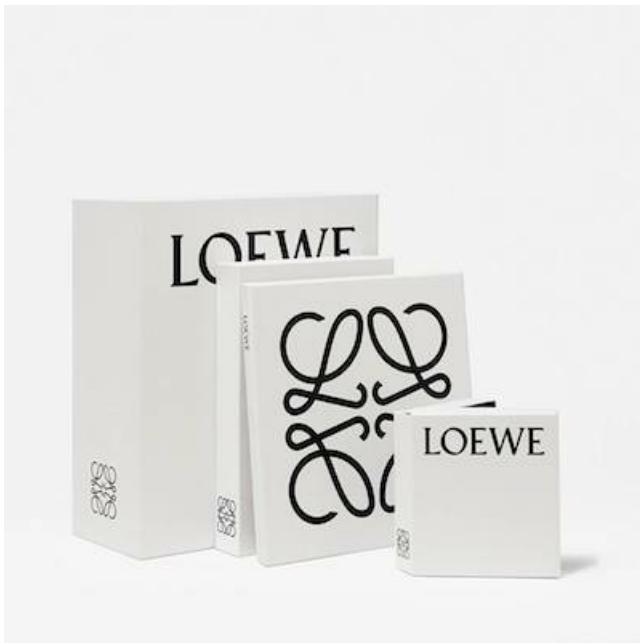
Loewe's logo includes a new monogram.

While designer Diane von Furstenberg has not announced plans to step away from her eponymous label, she hired Jonathan Saunders as chief creative officer in 2016. Leading up to Mr. Saunders' first collection for DVF in 2017, the brand retooled its logo.