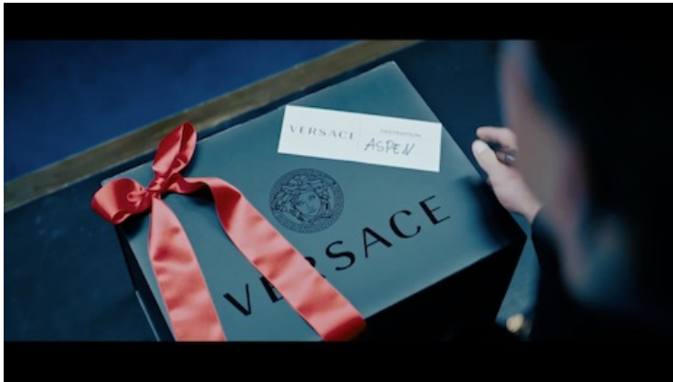
Still for Versace's holiday 2016 video.

Gianni Versace, meanwhile, was inspired by Greek mythology and the legend of Medusa, leading him to incorporate her face into the brand's logo.