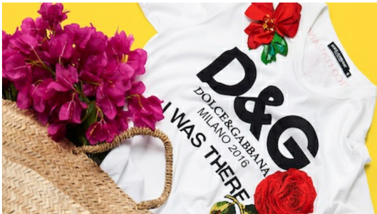
Dolce & Gabbana's "The Real Fake" T-shirt.

Fast-fashion players have taken a satirical approach to the logos of a number of luxury and designer brands, often taking their iconography and putting a comical spin on it. Labels are constantly working to protect their intellectual property, but taking a light-hearted jab at imitators may direct consumers to, as Dolce & Gabbana suggest, "The Real Fake" ( see story ).