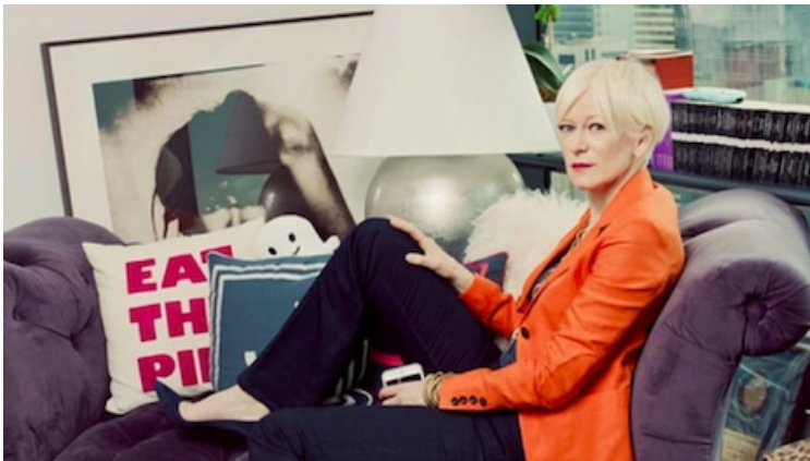
Joanna Coles will be leaving Hearst.