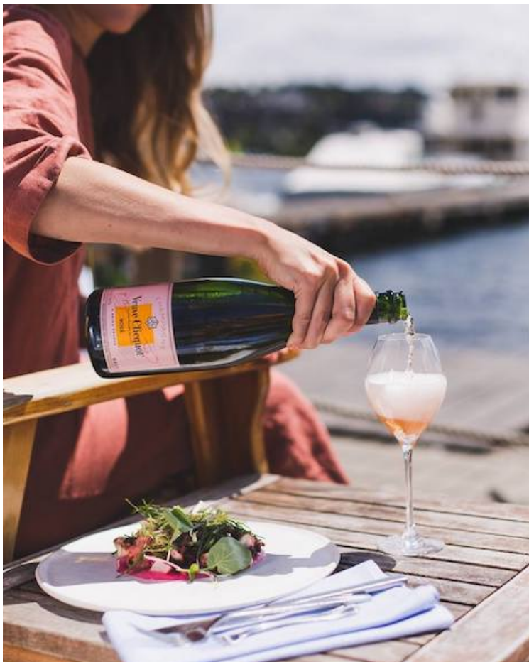
Madame Clicquot invented rosé.

Throughout her time leading the brand, she developed innovations that remain to this day, including the first blended rosé Champagne. The brand's name is also a reference to Madame Clicquot, as veuve means "widow" in French.