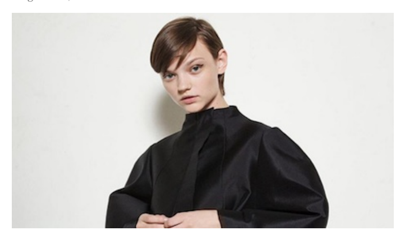
Lanvin spring/summer 2018 was the debut collection by Olivier Lapidus.