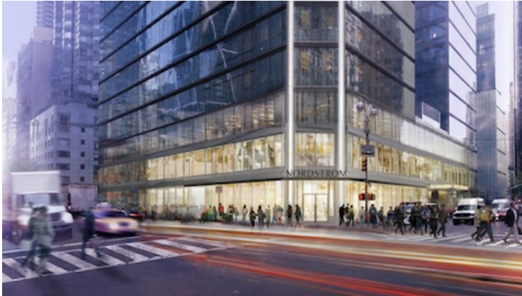
Multichannel retail has changed the way luxury consumers shop.