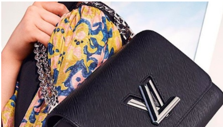
Louis Vuitton's Twist handbag.

Among the additions to Louis Vuitton's app is visual search, which enables consumers to snap a handbag or garment that catches their eye in a magazine or on a passerby to find it in the brand's catalog. Mobile has become an important channel for reaching luxury consumers, enabling brands to engage with their clients anywhere they are.