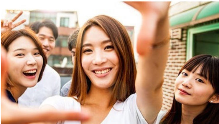
Chinese consumption of imported cosmetics grew by 40 percent last year.

China is one of the largest consumers of luxury goods in the world, as numerous studies throughout the last year have confirmed ( see story ).