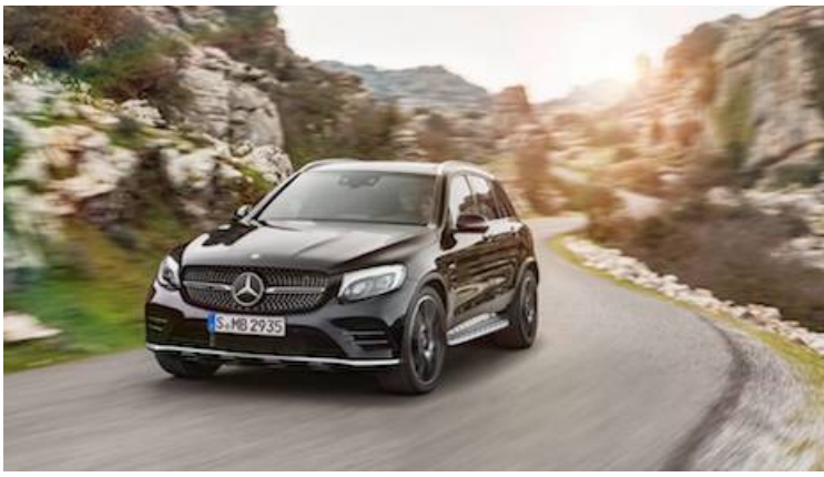
Mercedes' GLC would cost over 20 percent more if tariffs are implemented.

According to reports, if automakers choose to pass on increased costs to consumers, prices could rise by up to 20 percent — a difference of thousands of dollars. More than half of respondents, 53 percent, expect carmakers to put the burden of higher production costs on buyers and raise prices ( see story ).