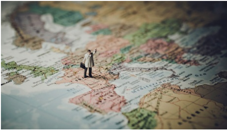
Affluents travel the world for best medical care.

Rosewood Sandhill in Menlo Park, CA offers long-term stays in villas for those recovering from medical needs.