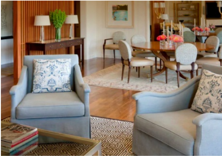
Villas at Rosewood Sandhill.