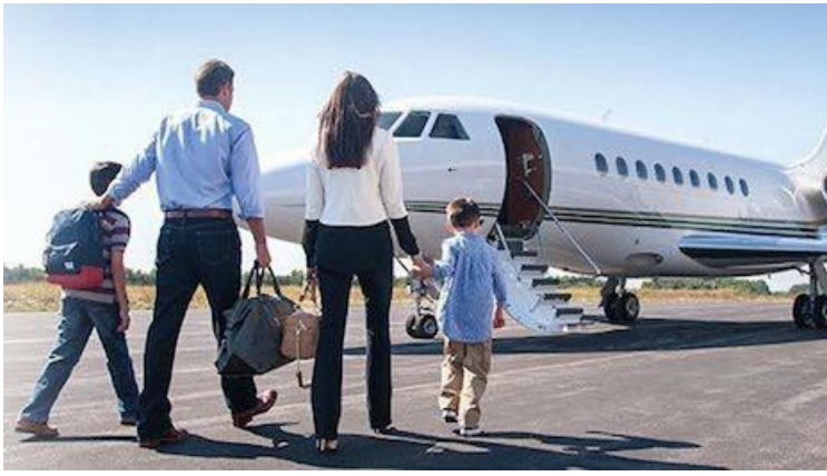
Sentient Jet aids in medical care.

Sentient has renewed its relationship with PinnacleCare for a second year, offering clients access to medical evacuation and health advisory services. For travelers with chronic illnesses, travel can be a stressful undertaking, leading to a number of healthcare-focused hospitality alliances.