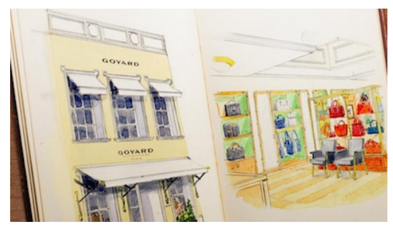
Decor illustrations of Goyard's new Beverly Hills store.

Goyard, which participates in zero ecommerce whatsoever, relies on its growing network of brand storefronts and retail partners to sell its leather goods. Originally, Goyard's only West Coast presence was at department store chain Neiman Marcus' Beverly Hills location and a standalone boutique in San Francisco (see story).