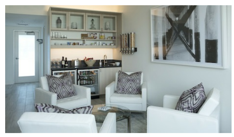
Four Seasons Private Suite at LAX.

Even the city's airport focuses on offering the finer things in life, as many affluent individuals and celebrities frequently travel throughLos Angeles International Airport, better known as LAX.