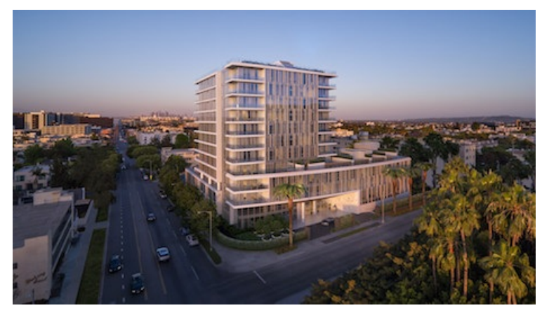
Four Seasons to debut first private residences in Los Angeles at gateway to Beverly Hills.

"What may be $20-plus million in the Bird Streets would likely be under $15 million west of the 405," he said. "They want a truer California lifestyle."