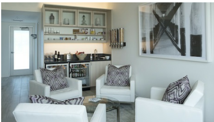
Four Seasons Private Suite at LAX.

Even the city's airport focuses on offering the finer things in life, as many affluent individuals and celebrities frequently travel through Los Angeles International Airport, better known as LAX.