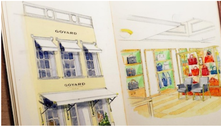
Decor illustrations of Goyard's new Beverly Hills store.

French leather goods maker Goyard opened its first standalone boutique in Beverly Hills last year on Rodeo Drive. Goyard, which participates in zero ecommerce whatsoever, relies on its growing network of brand storefronts and retail partners to sell its leather goods. Originally, Goyard's only West Coast presence was at department store chain Neiman Marcus' Beverly Hills location and a standalone boutique in San Francisco ( see story ).