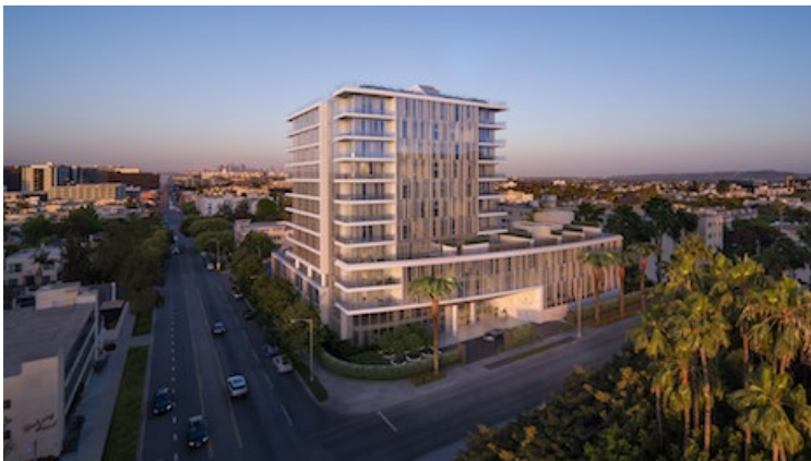
Four Seasons to debut first private residences in Los Angeles at gateway to Beverly Hills.

"What may be $20-plus million in the Bird Streets would likely be under $15 million west of the 405," he said. "They want a truer California lifestyle."