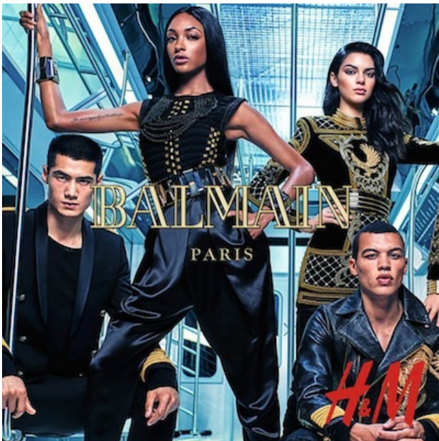
Balmain for H&M.

H&M and Target have each launched a series of designer partnerships, bringing in labels such as Missoni, Versace and Balmain for one-off lines. These give more consumers an affordable entry point to a brand, making similar styles at a fraction of the cost.