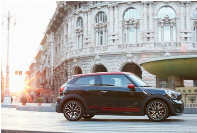
Mini Cooper.

In an effort to meet millennial demand, Estée Lauder acquired premium label TooFaced. Similarly, BMW added Mini to its stable in the 1990s, expanding its price range.