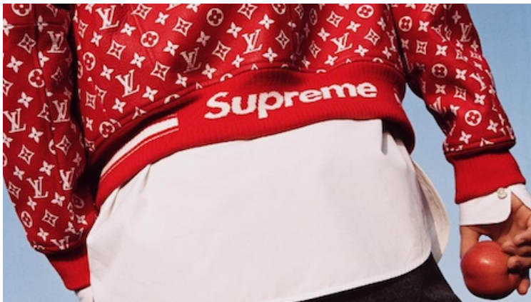
Louis Vuitton x Supreme collection.

This trend is reflected in the rise of streetwear, as brands such as Supreme and Off-White find a footing particularly with a younger crowd.