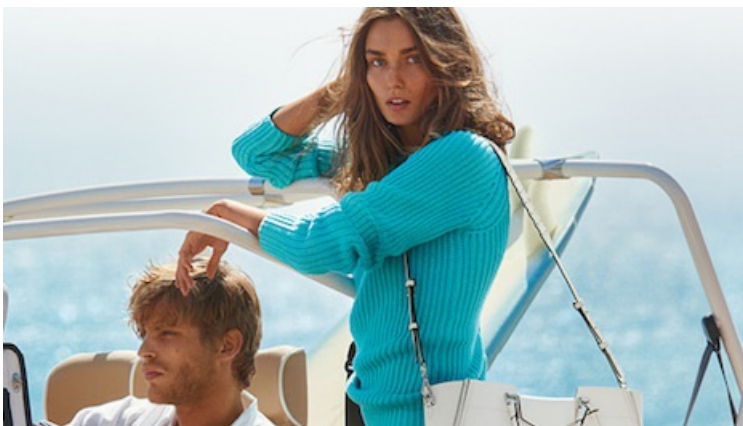
Michael Kors' revenues were up in fiscal 2018.

The company's profits grew 30.6 percent year-over-year in the first quarter of this fiscal year, bolstered by higher margins from both businesses. Recently, Michael Kors has made moves to make its retail presence less promotional, looking to sell more full-price, elevated merchandise.