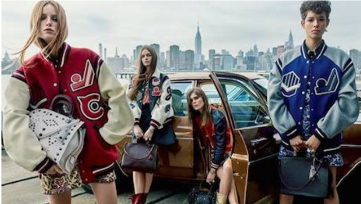
Coach, Inc. transitioned to Tapestry.