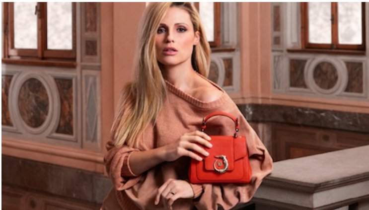
Trussardi Lovy bag.

Part of the house's planned five-year transformation toward accessible luxury, the Lovy bag features the craftsmanship and design details at an approximate $600 price point ( see story ).