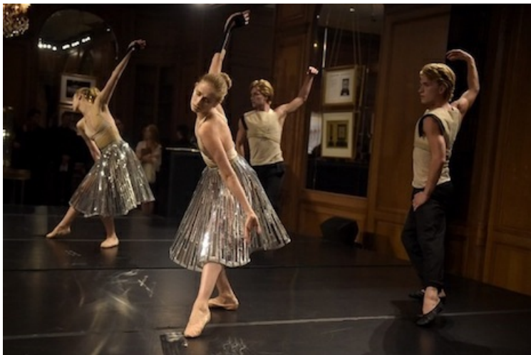
NYC Ballet performing at Cartier's Fifth Avenue opening.

For instance, in 2016 Cartier held a star-studded soiree in New York for the reopening of its Fifth Avenue store that included live music and dance performances.