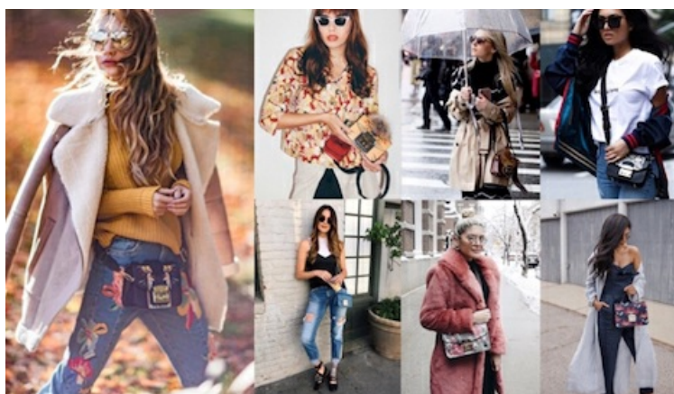
Furla received organic placement through PR.

One way in which brands are bridging the gap between earned and paid media is through organic influencer content. For instance, in an effort to raise awareness in the U.S. for Furla, Linda Gaunt Communications gifted influencers with handbags, resulting in more than 101 million earned impressions through 686 non-paid placements.