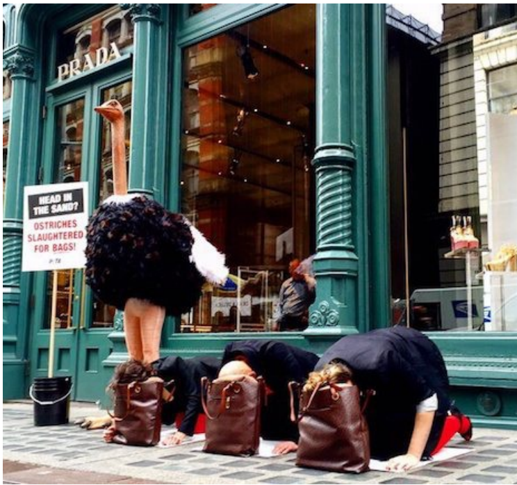
PETA has targeted Prada.

A number of brands, including Prada and Hermès, have been the targets of repeated protests and PR campaigns from People for the Ethical Treatment of Animals.