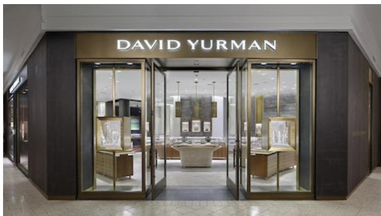
David Yurman Short Hills Boutique.