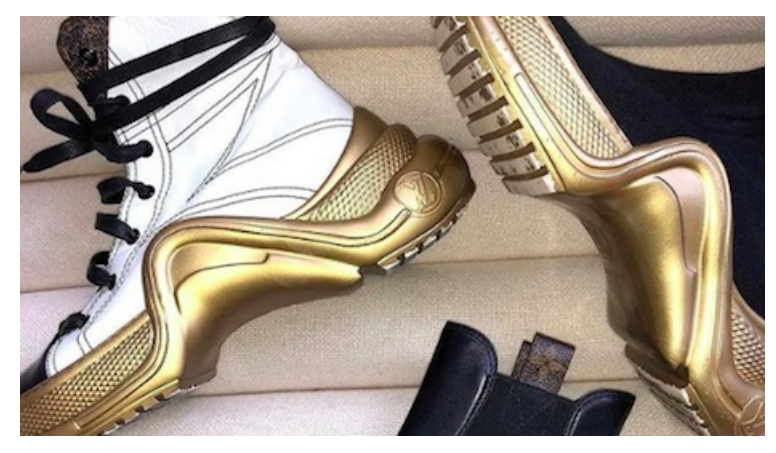
Louis Vuitton's cruise collection designed by Nicolas Ghesquiere