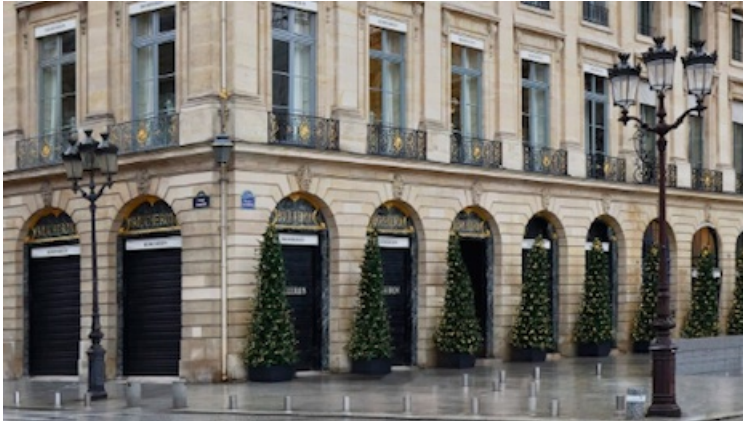
Boucheron's historic flagship.