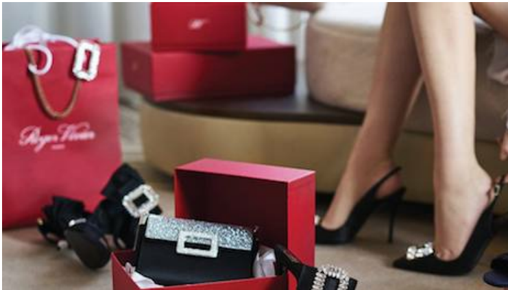
Black Friday and Cyber Monday participation was up in 2018.

Up from 58 percent last year, 69 percent of consumers shopped on Cyber Monday in 2018. Nearly a quarter, 24 percent, spent between $250 and $500 on that day alone.