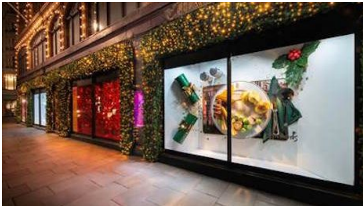
Harrods' holiday windows.