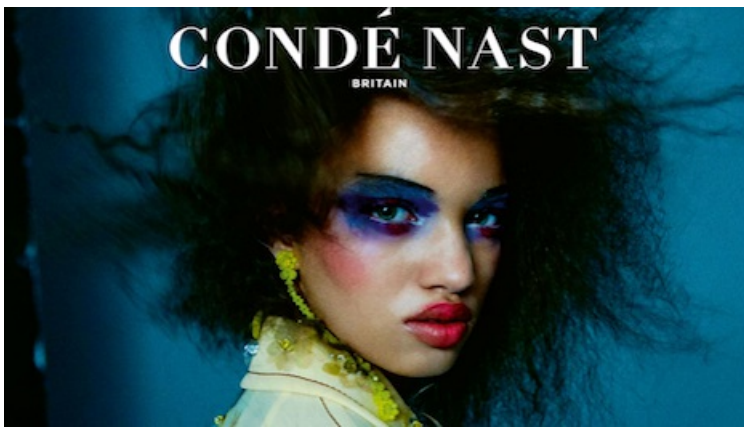
Condé Nast International is Luxury Daily's Publisher of the Year.

Condé Nast International is Luxury Daily's 2018 Publisher of the Year for navigating the rough waters of the current media environment with not just engaging content, brand collaborations and more regional editions, but integrally shifting its business model to fit modern-day needs.