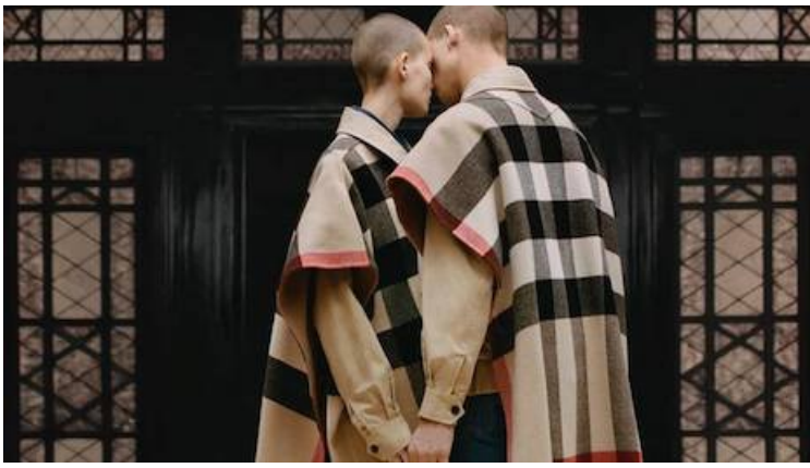
Burberry has undergone changes this year.

British fashion house Burberry is Luxury Daily's 2018 Luxury Marketer of the Year for its thorough brand transformation under the direction of newly appointed chief creative officer Riccardo Tisci.