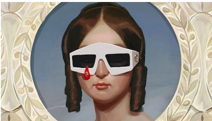
Gucci's spring summer campaign for 2018 features an interactive art gallery.

Nordstrom was named over runner's-up Saks and honorable mentions Harrods and YNAP. These retailers introduced a new vision this past year to better serve shoppers in the highly connected, multichannel atmosphere of current retail ( see story ).