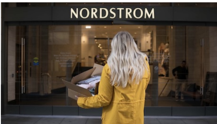
Nordstrom bolsters its growth with new promotions.

Burberry won over first runner's up Tiffany & Co. and honorable mention Chanel. All brands showed significant risk taking strategies in hopes to stay on top in the much more interactive, current luxury landscape ( see story ).