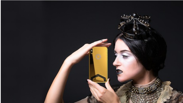
Brikk's Lux iPhone X.

Other brands are looking to change the already existing products to make them more unique, such as Brikk, who turned Apple's iPhone X into a greater status symbol by outfitting the devices in precious materials.