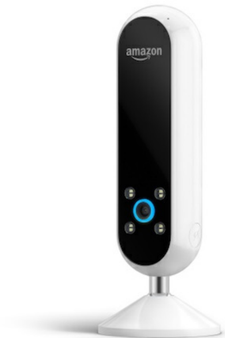
Amazon Echo Look

However, unlike watch brands, where luxury brands are trying to compete with smartwatches by tech companies, luxury brands are trying to be part of the home assistant experience rather than creating their own.