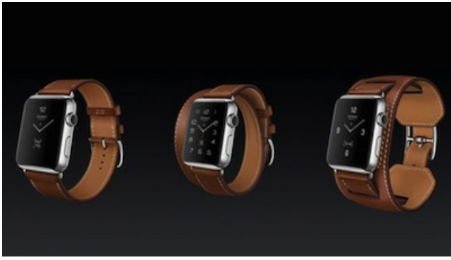
Hermès Apple Watch straps

Some have incorporated tech giants technology, such as Michael Kors' reintroduction of its classic Runway watch model as a smartwatch powered by Google.