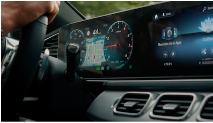
Voice technology is featured in a key part of the campaign.

For instance, German automaker BMW is enabling owners to operate functions of their vehicles from inside their homes by integrating Amazon's Alexa voice service.