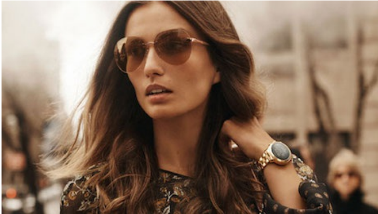
Michael Kors' smartwatch sales are growing.