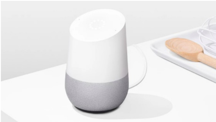
Google's software dominance has led to its success in the hardware sector as well.

Beauty marketer Estée Lauder has also embraced the new trend by collaborating with Google on a personalized voice-activated tool for Google Home.