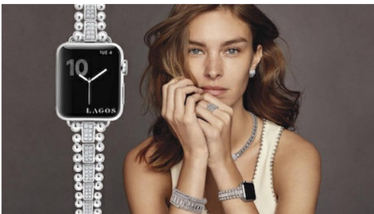
Lagos Apple Watch strap.

As early as 2015, when smartwatches were still seen as a disruptor rather than a sector draw, experts agreed that the wearables concept required a combination of fashion and function if consumers were to be interested. While tech designs, such as Apple Watch, do take inspiration from traditional timepieces, smartwatches that marry true analog qualities with functionality are growing in popularity and demand ( see story ).