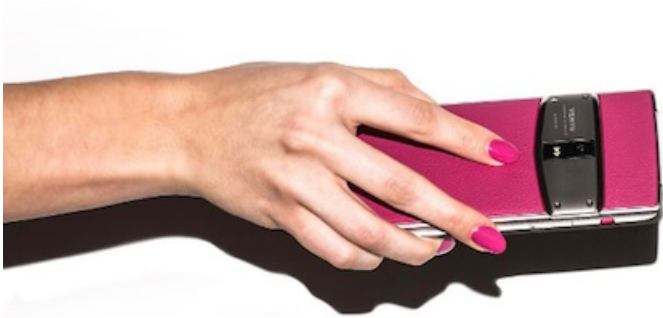
Vertu recently had all of its assets liquidated.

The luxury cell phone industry is a unique business venture, and one that many are weary to enter secondary to Vertu's tale. In August 2017, Vertu closed its doors, signaling the dangerous road for luxury brands that seek to enter the world of consumer electronics.