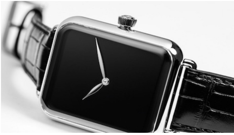
Luxury brands today pull inspiration from all over.

The Swiss Alp Watch Zzzz is almost a direct copy of the Apple Watch with one key difference: it is entirely analog. Communications for the timepiece makes the comparison almost explicit, suggesting that H. Moser is having some fun at the expense of the tech-obsessed while reinforcing the superiority of its high-end watches ( see story ).