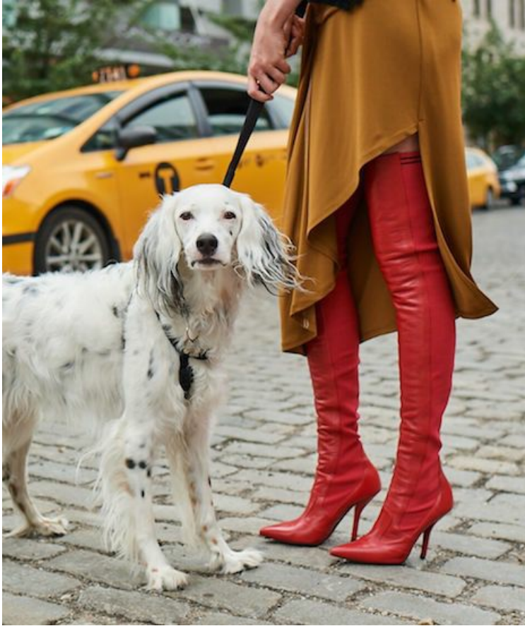
Look book image featuring Fendi by The Dogist for Neiman Marcus.

in photos of their pets peeking out of bags, some of which were reposted on the retailer's Instagram ( see story ).