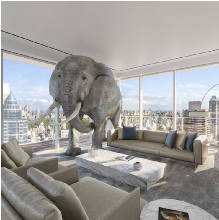
500 East 59th building is fit for an elephant.

In real estate, a campaign that might have previously shown a family, or a young socialite, had unlikely actors of wild animals. Macklowe Properties' 200 East 59th Street luxury building in New York filled up its residences through a surprising campaign.