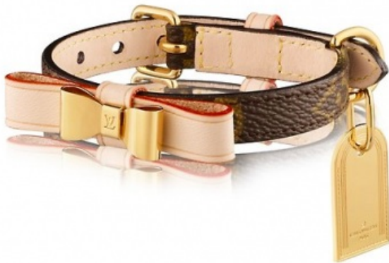
Louis Vuitton dog collar.

Other brands have similarly joined the trend of dog accessories. Gucci and Louis Vuitton have dog carriers, Ralph Lauren has a dog trench coat and Goyard has a dog collar charm.