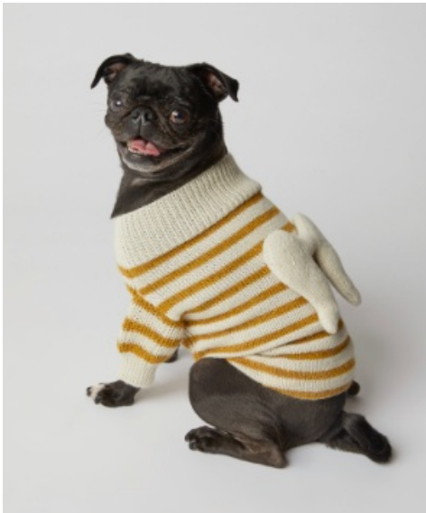
Moda Operandi dog accessories

Other brands have similarly joined the trend of dog accessories. Gucci and Louis Vuitton have dog carriers, Ralph Lauren has a dog trench coat and Goyard has a dog collar charm.