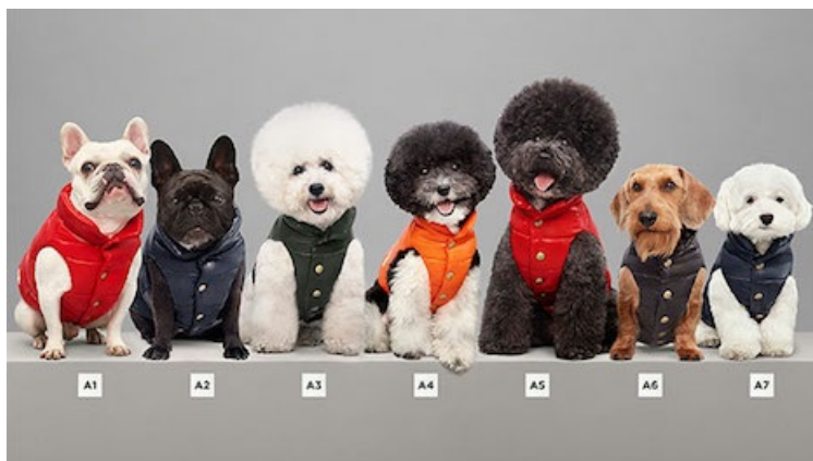
Poldo Dog Couture for Moncler.