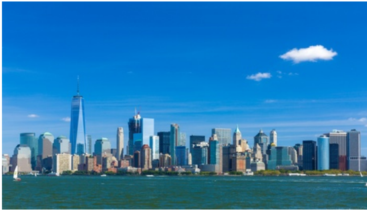
Blue skies ahead?

Please check out Luxury FirstLook 2019's agenda below: