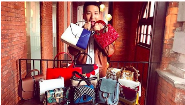
Mr Bags Instagram post sponsored by Grazia.

While this form of marketing may seem like a fad to some, it is actually a significant source of engagement for brands. Eighty-four percent of sponsored posts last year saw at least 1,000 likes per post.