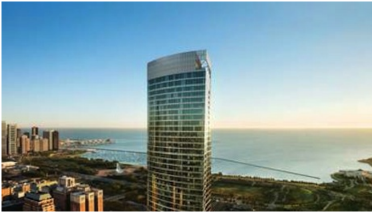
Chicago's 1000M is located on one of the city's most iconic streets

"Condominium deconversions are another big trend in Chicago," @properties' Mr. Rocio said. "The reversal of condominium conversions from the last 20 years will continue to see a vigorous appetite from investors across the globe, who are looking for assets in tony Chicago neighborhoods.