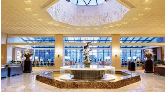
The Ritz-Carlton Chicago.

For example, The Ritz-Carlton Chicago achieved full brand status in 2015, and it boasts 429 rooms, including 101 suites ( see story ).