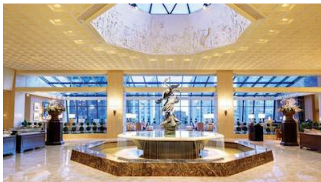
The Ritz-Carlton Chicago.

For example, The Ritz-Carlton Chicago achieved full brand status in 2015, and it boasts 429 rooms, including 101 suites ( see story ).