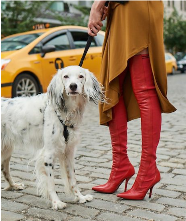
Look book image featuring Fendi by The Dogist for Neiman Marcus.

in photos of their pets peeking out of bags, some of which were reposted on the retailer's Instagram ( see story ).