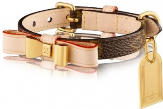
Louis Vuitton dog collar.

Other brands have similarly joined the trend of dog accessories. Gucci and Louis Vuitton have dog carriers, Ralph Lauren has a dog trench coat and Goyard has a dog collar charm.