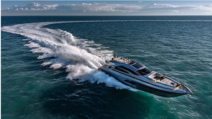
Ferretti's Pershing 8X.