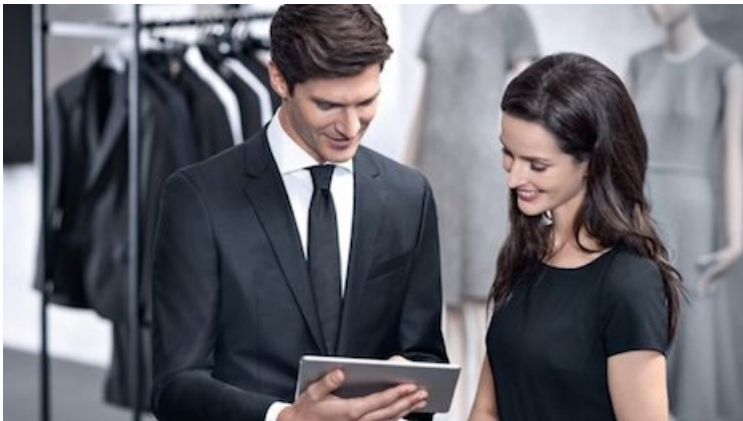
In-store technology is a key concern of sales associates.

“The stakes are high because the customer experience – great or disappointing – has wider repercussions than ever before,” he said. “As soon as I walk out of your store, I can rave or rant about you. And nobody raves about average.”