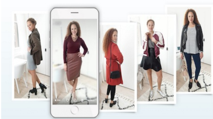
Artificial intelligence will open new doors and opportunities for luxury.

Although warm and humane interactions are at the heart of customer service ( see story ), brands are increasingly turning to technological innovations to streamline and enhance customer experiences.