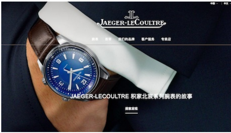
Jaeger LeCoultre's Web site in China

Brands with omnichannel capabilities can also store online conversations and interactions on a customer's profile to help guide future interactions regardless of the channel.