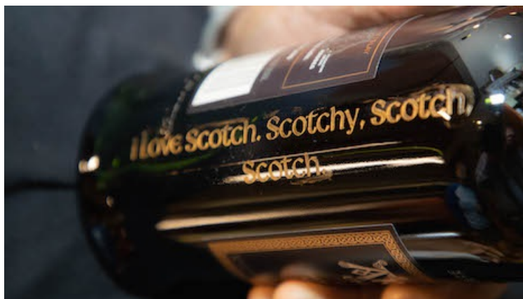
Customers can get personalized engravings, including quotes from comedy films such as this one from Anchorman.

Convenience in the luxury business means making sure customer service avenues are as seamless as possible. Whether a customer is calling a hotline, visiting a store, or reaching out on social media, luxury brands have to provide personalized service (see story).