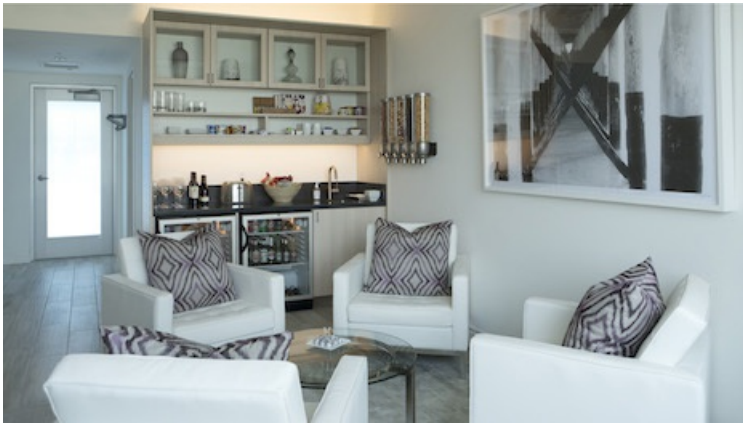
Four Seasons Private Suite at LAX.

Since hospitality companies are widely known for their exceptional customer service, brands in other sectors often partner with hotels to improve relationships with customers. Many fashion brands are even entering the hospitality market as a way to distinguish their unique take on customer service ( see story ).