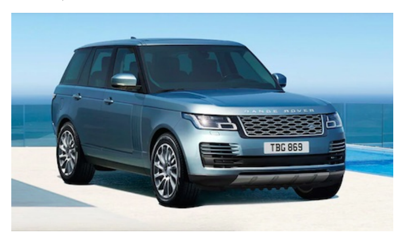
Range Rover Vogue SUV involved in laws uit.