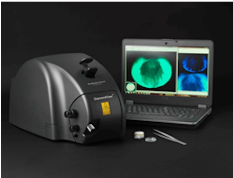
DiamondView, one of the technologies showcased in the lab.