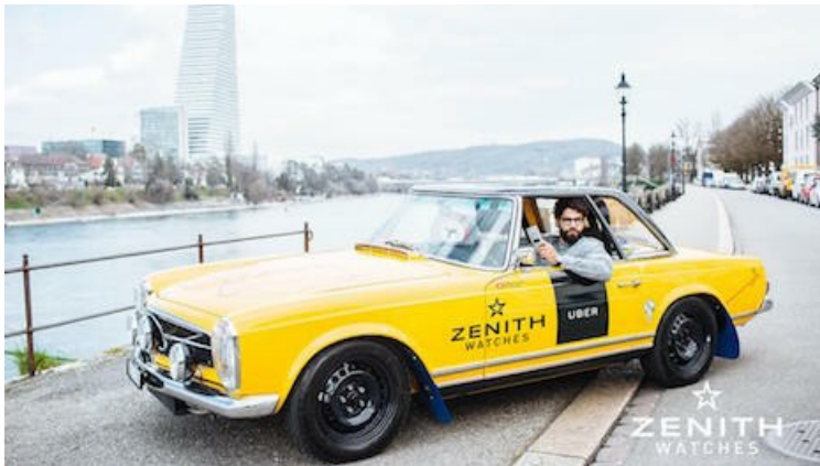
Zenith-branded classic car, provided by Uber for Baselworld

Since 2017, per capita wealth in the city has increased, and it shows no sign of slowing down.