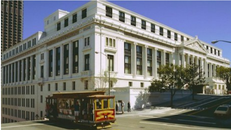
Exterior of The Ritz-Carlton, San Francisco