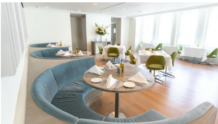
Freds new location in San Francisco

High-end restaurants with deep legacies are also moving to the city. Department store chain Barneys recently brought its iconic New York restaurant Freds to San Francisco, adapting the menu to include local ingredients ( see story ).