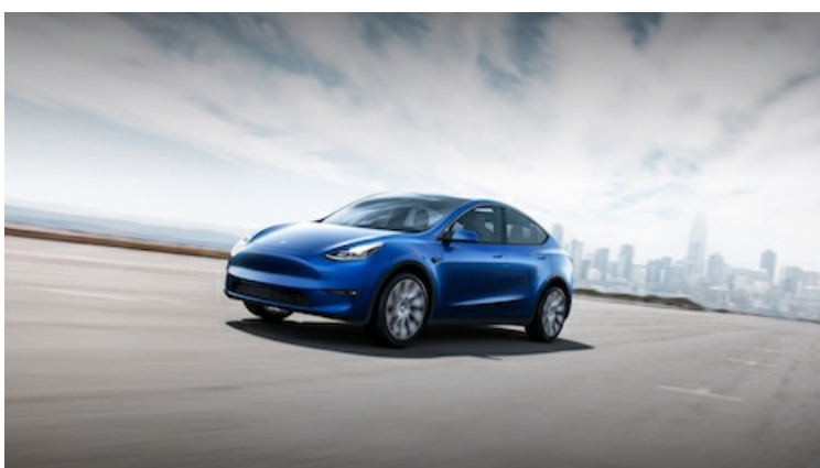
Tesla's Model Y.

In the immediate aftermath of this wealth creation, wealth managers expect to see a rise in extravagant parties and conspicuous consumption . Luxury brands in particular will likely see a rise in major purchases from furnishings for new homes to high-end automobiles for new garages.