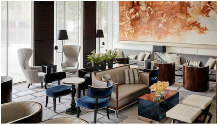
St. Regis San Francisco lobby

Luxury properties in San Francisco have prioritized sustainable offerings in recent years. For example, the Ritz-Carlton has stopped serving plastic straws in response to growing concern around plastic pollution, according to a representative over email.