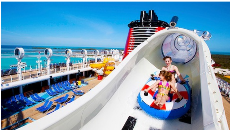
Inspirato is now working with Disney Cruises.

Disney Vacation Club is bringing a variety of packages to customers of private travel club Inspirato, including Disney Cruises and Adventures by Disney excursions ( see story ).