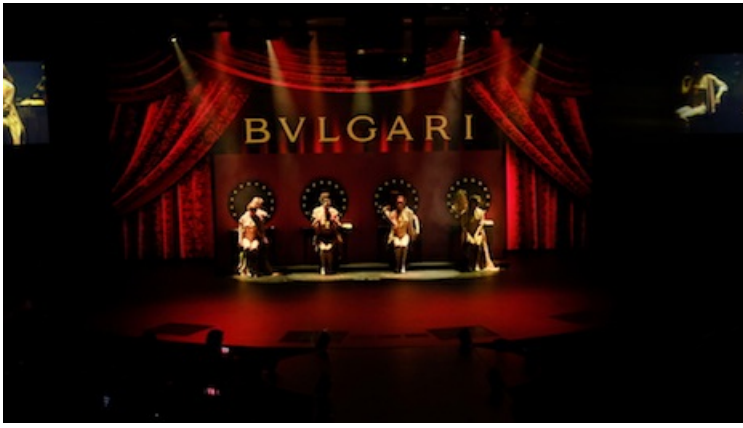
Bulgari is hosting a show on Costa Venezia.

Starboard Cruise Services and Costa Cruises has partnered with Italian jeweler Bulgari to stage an onboard experience that blends elements of entertainment, product showcase and brand education. The Bulgari Jewelry Fashion Show will be held once per itinerary on the newly launched Costa Venezia vessel.