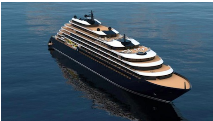
Ritz-Carlton has opened booking for its yachting service.

While the Ritz-Carlton Yacht Collection experience slightly resembles a cruise, the brand emphasizes that the smaller size of its vessels not only provides a more personal and intimate experience, but can also take visitors where the larger cruise ships cannot venture ( see story ).