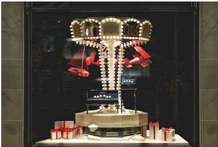
Dfrost's window displays for IWC Schaffhausen.