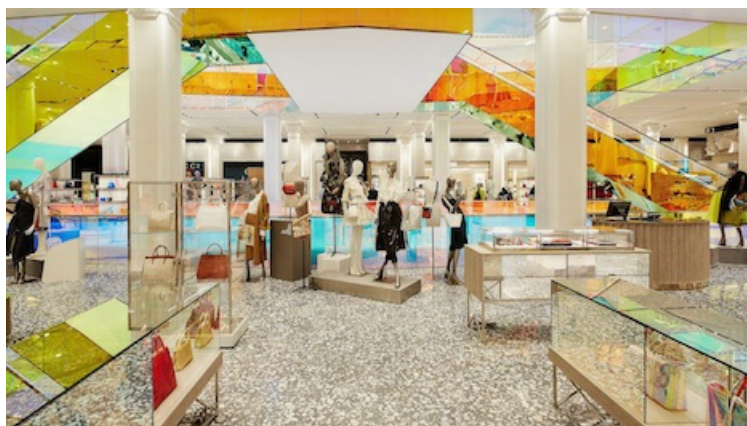
Saks Fifth Avenue's innovative store design.

For instance, Saks Fifth Avenue recently remodeled its flagship store in New York to provide a more intimate shopping environment for its beauty and jewelry collections. Both of these categories were moved off the ground floor, making way for a leather goods department ( see story ).