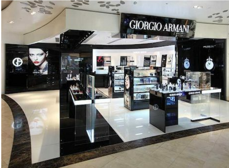
Lab:Om created a storefront for Giorgio Armani Beauty at T Galleria by DFS, Macau, Shoppes At Four Seasons.