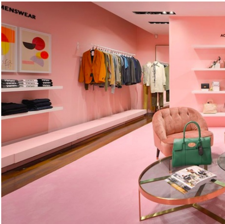
Harrods' pop-up was made in millennial pink.