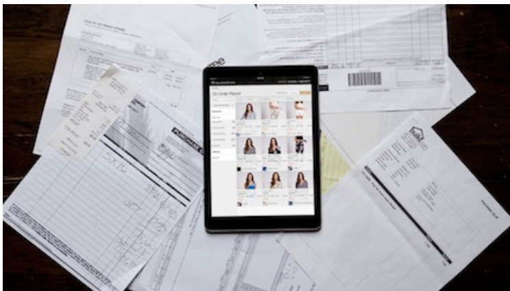
Joor's mobile application solution for retail buyers.

Through the Joor platform, buyers can browse and place orders from brands, making the wholesale experience faster and less prone to error. Along with Holt Renfrew, Joor works with a number of luxury brands including Neiman Marcus, Printemps and Harrods ( see story ).