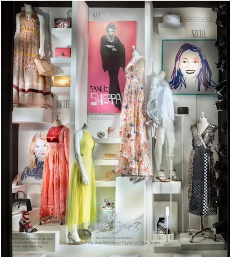
BG Style Experts window display at Bergdorf Goodman

Bergdorf Goodman invited 25 of its sales associates, both from its men's and women's wear stores, to style its legendary windows. Part of "BG Style Experts," the department store's spring campaign, the effort also included social media activations, in-store displays and editorialized content featured in Bergdorf Goodman magazine, in print and online (see story).