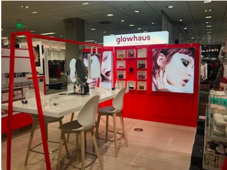
Bloomingdale's Glowhaus at South Coast Plaza.

Bloomingdale's is offering a "beauty happy place" for cosmetics-lovers with a new boutique called Glowhaus. The boutique will specialize in beauty products from a number of brands and will give customers a place where they can freely try out and test different combinations and products in a casual and freeform environment ( see story ).