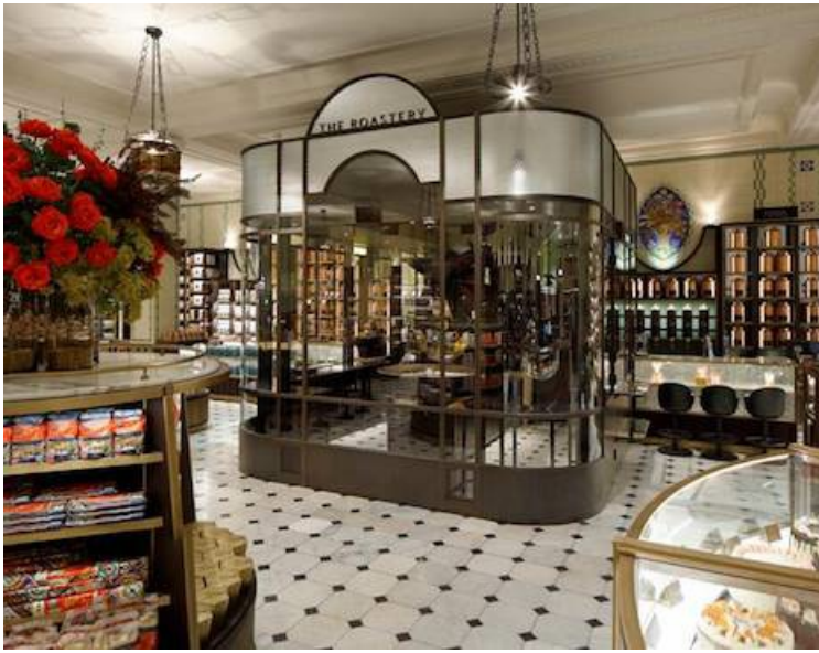
Harrods' roastery.