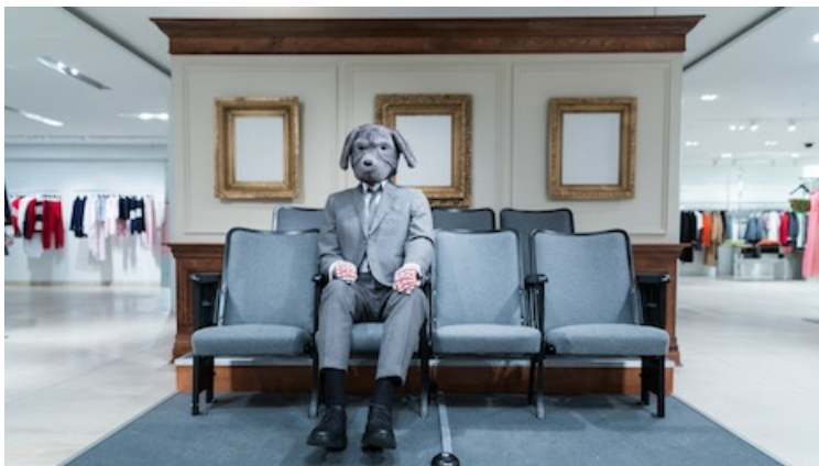
Thom Browne hosted a takeover at Barneys New York.

Among the experiences was a Self Portrait Project that enabled consumers to take hands-free photos of themselves in situations that resemble a brand film or a moment from the brand's fall/winter 2018 runway show ( see story ).