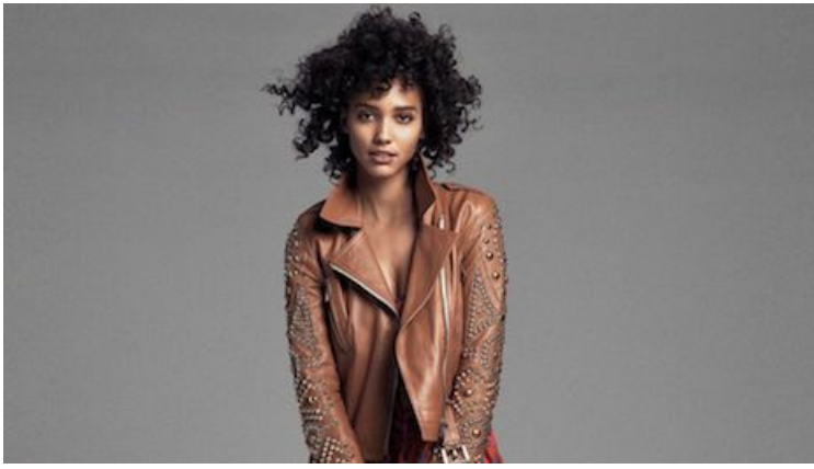
Neiman Marcus' Luxe Lab encourages consumers to mix vendors.

In 2014, Bloomingdale's debuted its "100 percent Bloomies" campaign, which had 100 designers with 1,000 exclusive items at one store. The campaign was further enhanced through designer capsules on the store's Web site that feature the exclusive items from the 100 designers ( see story ).