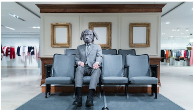
Thom Browne hosted a takeover at Barneys New York.

Among the experiences was a Self Portrait Project that enabled consumers to take hands-free photos of themselves in situations that resemble a brand film or a moment from the brand's fall/winter 2018 runway show ( see story ).