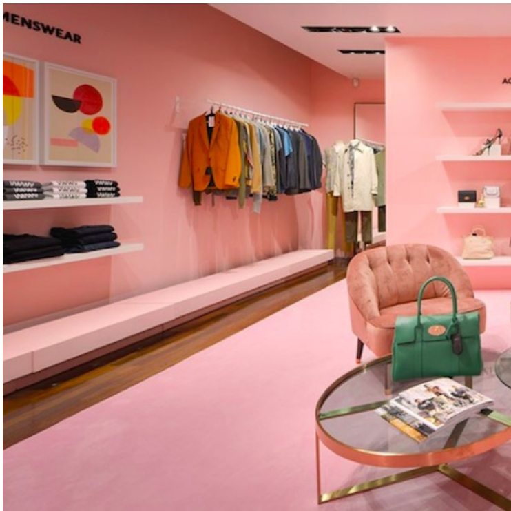
Harrods' pop-up was made in millennial pink.