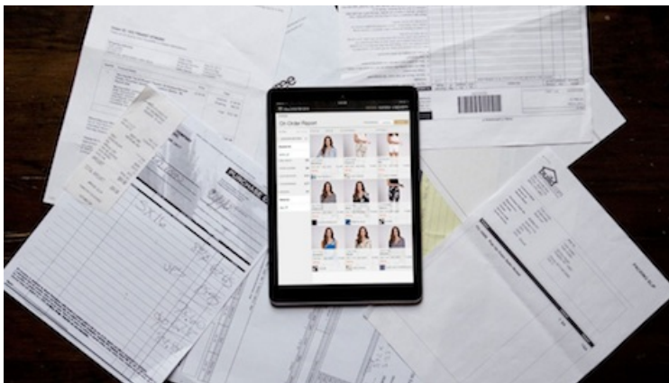
Joor's mobile application solution for retail buyers.

Through the Joor platform, buyers can browse and place orders from brands, making the wholesale experience faster and less prone to error. Along with Holt Renfrew, Joor works with a number of luxury brands including Neiman Marcus, Printemps and Harrods ( see story ).