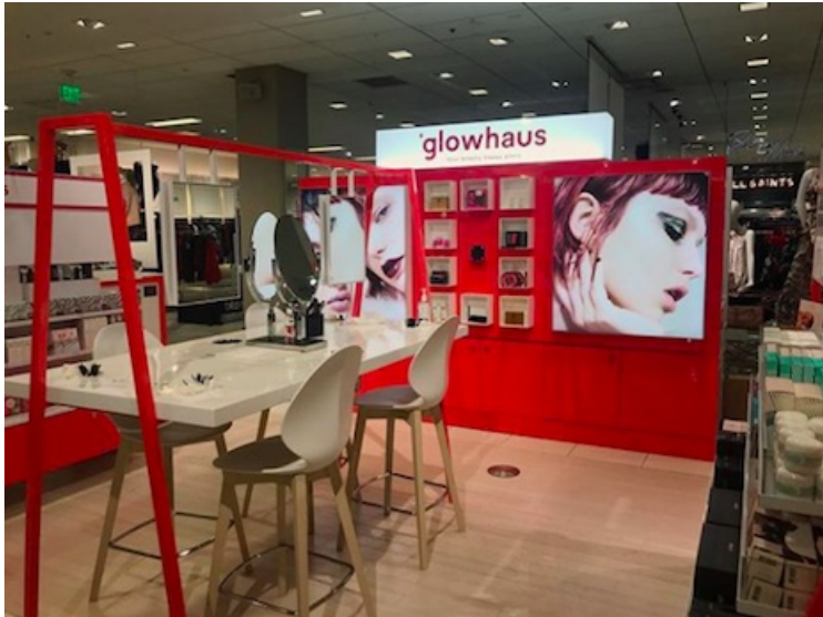
Bloomingdale's Glowhaus at South Coast Plaza.

Bloomingdale's is offering a "beauty happy place" for cosmetics-lovers with a new boutique called Glowhaus. The boutique will specialize in beauty products from a number of brands and will give customers a place where they can freely try out and test different combinations and products in a casual and freeform environment ( see story ).