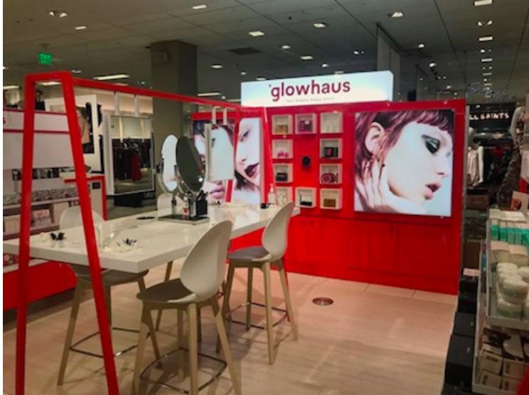
Bloomingdale's Glowhaus at South Coast Plaza.

Bloomingdale's is offering a "beauty happy place" for cosmetics-lovers with a new boutique called Glowhaus. The boutique will specialize in beauty products from a number of brands and will give customers a place where they can freely try out and test different combinations and products in a casual and freeform environment ( see story ).