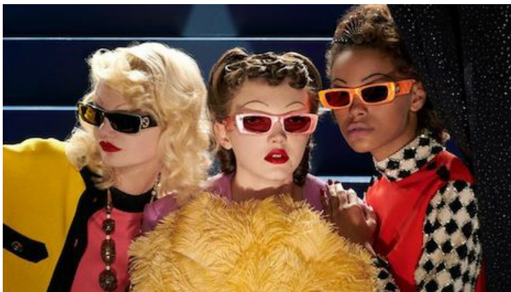
Gucci's revenues were up double digits.

After Mr. Ford's reign at the company, the brand became more focused on design and its licensing agreements became extremely narrow and maintained. This is a strategy many luxury brands follow today.