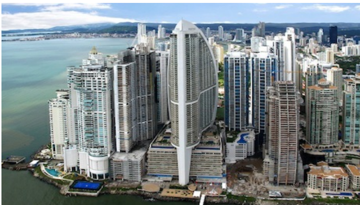
The Trump hotel in Panama is working to abandon the Trump name and disassociate from the Trump Organization.

After the iconic hotel in SoHo in New York's Manhattan borough dropped the Trump Organization, another hotel in Panama started the process of stripping the Trump name from the hotel's association, after paying around $32 million for the association. While President Trump continues to accrue near-daily controversies, the many brands that bear his name are beginning to feel the danger of continuing to associate with the man ( see story ).