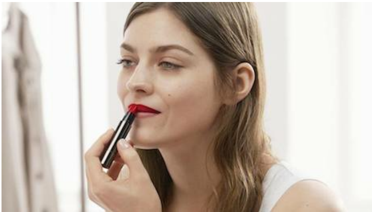
Burberry's beauty business is being licensed.

In 2012, Burberry opted to end its licensing deal with Inter Parfums, moving its beauty production and distribution in-house. Now, Burberry has reversed course again, and has become a Coty licensor under a long-term global deal ( see story ).