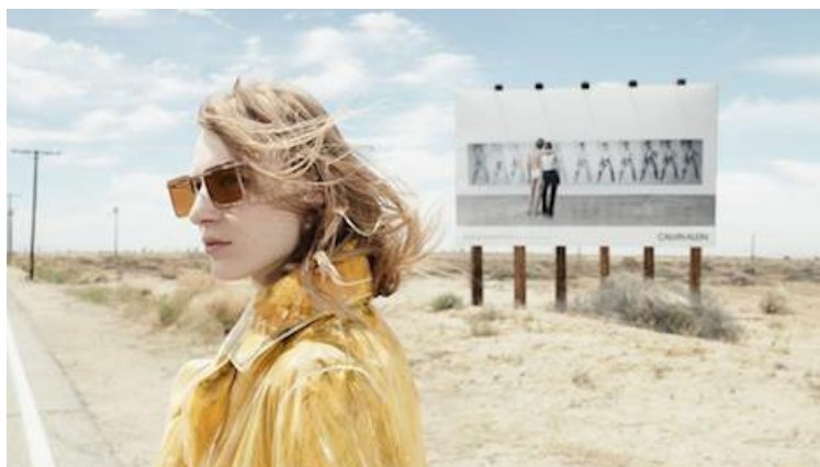
Calvin Klein 205W39NYC eyewear.

The multi-year agreement covers the design, development, production and distribution of optical and sunglass styles under the company's Calvin Klein 205W39NYC, Calvin Klein, and Calvin Klein Jeans labels ( see story ).