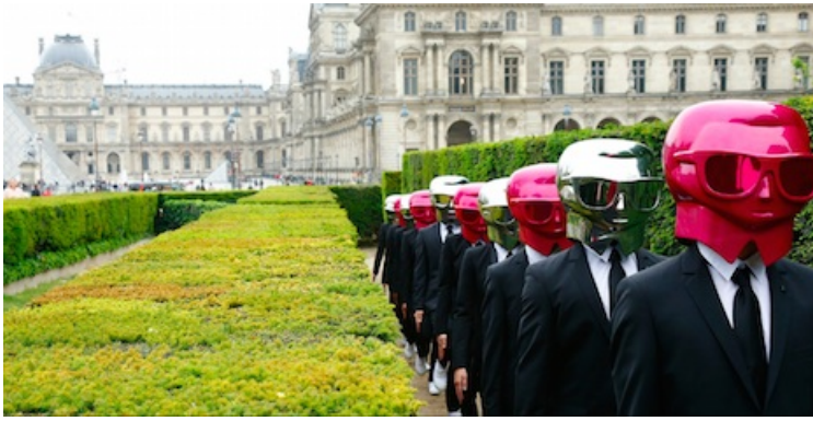
Karl Lagerfeld delves into hotels.

Italian jeweler Bulgari has also just added a fourth "jewel" to its collection of high-end hotels and resorts with the opening of its Beijing property.