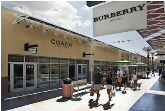
Las Vegas North Outlets.

Luxury brands have always had a rocky relationship with off-price merchandise. To brand loyalists, off-price can seem like a betrayal of brand values, which can result in declining revenue over time.