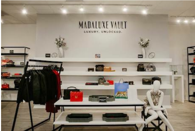
MadaLuxe Vault store in Los Angeles.

Outlet stores also help luxury brands fend off the rise of the resale market, which is projected to grow to $33 billion in value by 2021. The resale market, which is driven by millennials, the sharing economy and a broad lifestyle trend toward decluttering, has the potential to siphon significant revenue from the luxury market ( see story ).