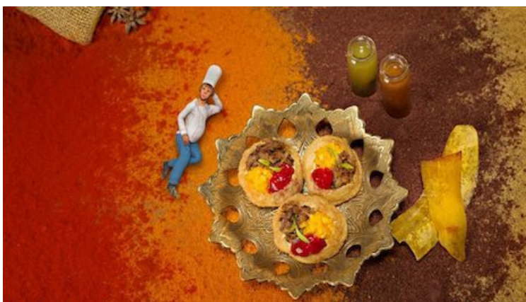
Le Petit Chef at Mandarin Oriental, Marrakech.

The Mandarin Oriental regularly partners with famous chefs in property locations for pop-up events that sometimes lead to full-blown restaurants ( see story ).