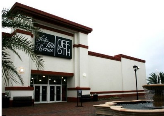
Saks Off 5th.

Additionally, outlet stores have come to be seen as a major growth engine for department stores that have suffered from a lack of foot traffic to bricks-and-mortar locations. Major players in this field such as Nordstrom, Saks Fifth Avenue and Bloomingdale's have all invested heavily in their outlet programs ( see story ).