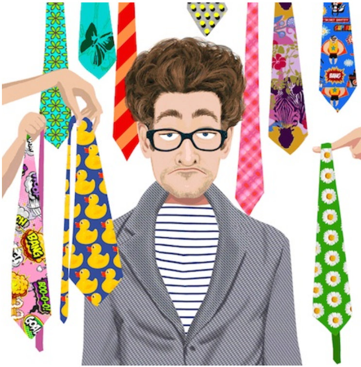
Longchamp Father's Day 2017 email

While the vast majority of affluent customers say that they prefer to shop during sales, luxury brands have to be realistic about their ability to withstand the withering effects of going off-price ( see story ).