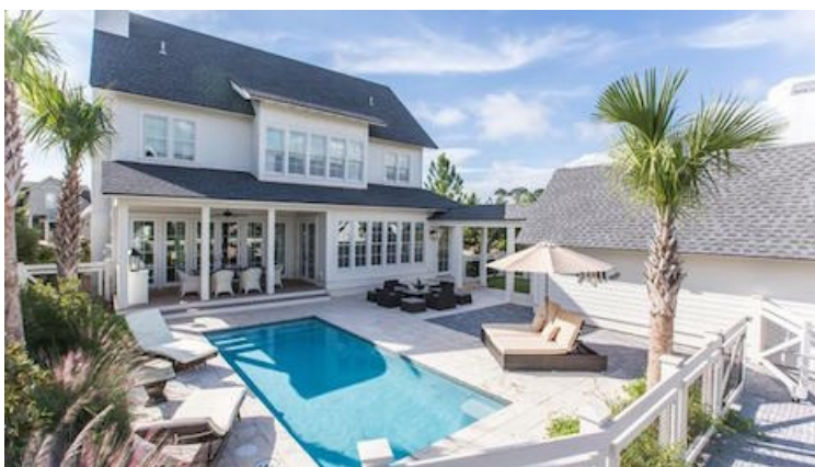
Home rentals are becoming extremely popular.

Marriott International has even competed directly on Airbnb's turf by investing in a home rental business ( see story ).