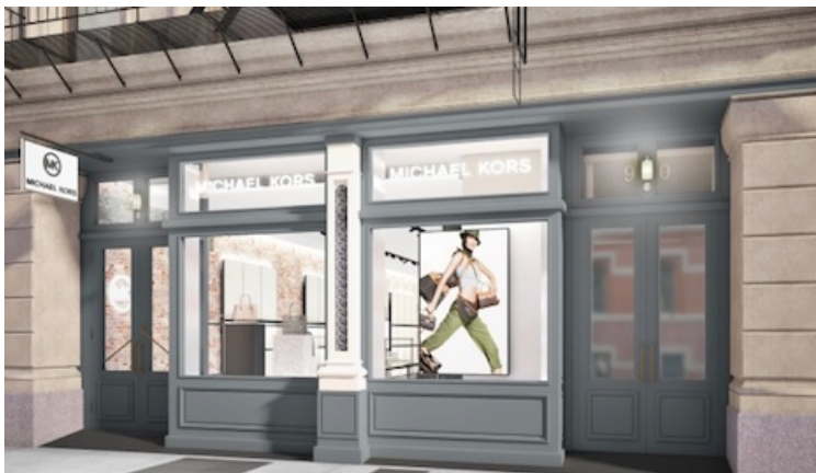
Rendering of Michael Kors' future SoHo store.

In addition to diffusion lines, brands have also increasingly turned to licensing deals, an option that holds far more risk because it gives brands less control over the final product ( see story ). For example, British fashion house Burberry has had to cancel licensing deals in the past because of poor execution ( see story ).