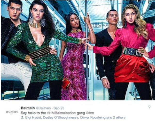
Campaign ad for Balmain's partnership with H&M

Affluent millennial consumers tend to have less affinity for the traditional markers of luxury and are happy to mix high-fashion with low-fashion. As a result, partnering with brands of different price points, while counterintuitive, can help to build long-term brand equity ( see story ).