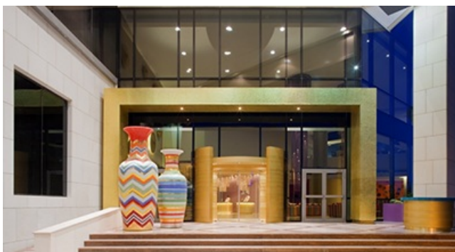
Missoni Home aligned with Target. Image credit: Missoni Home

Few brands have embraced partnerships more than the Italian fashion house Missoni, which has most recently partnered with the shoe brand Adidas for a collection of athletic wear ( see story ). Missoni Home also partnered with the mass market department store Target for a hugely popular capsule collection ( see story ).