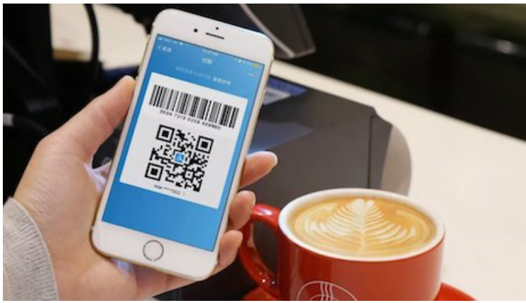
Alipay makes it easier to pay through mobile devices.