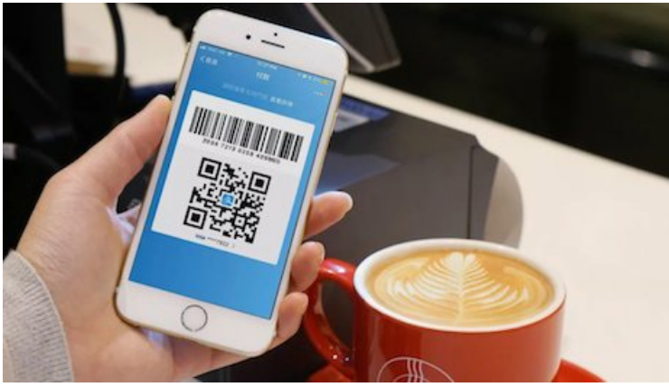
Alipay makes it easier to pay through mobile devices.