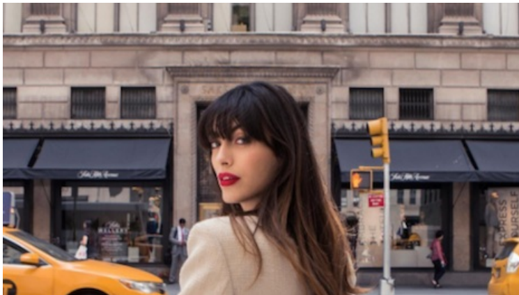
Exterior of Saks Fifth Avenue.

Saks had a data breach, while Neiman Marcus agreed to settle with those affected by a 2013 credit card information leak. As ecommerce becomes more of a common practice for affluent consumers making high-end purchases, cybersecurity measures will need to be a priority for luxury brands ( sees story ).