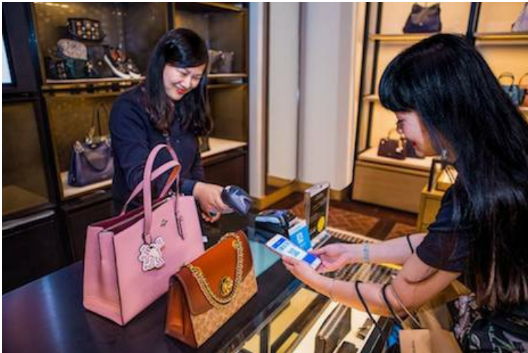
Alipay in the Dubai Mall.

Apple Pay, Alipay, Google Pay, Chase Pay, WeChat Pay and Masterpass are just a few of the mobile solutions available for customers to check out in stores.