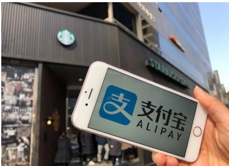
Alipay is accepted at Starbucks.

When traveling overseas, more than 90 percent of Chinese tourists will use mobile payment platforms if the option is available, according to a report from Nielsen and Alipay. While Chinese consumers are more digitally savvy than other travelers, mobile pay also eases the difficulties that can come with language barriers and other issues from traveling abroad ( see story ).