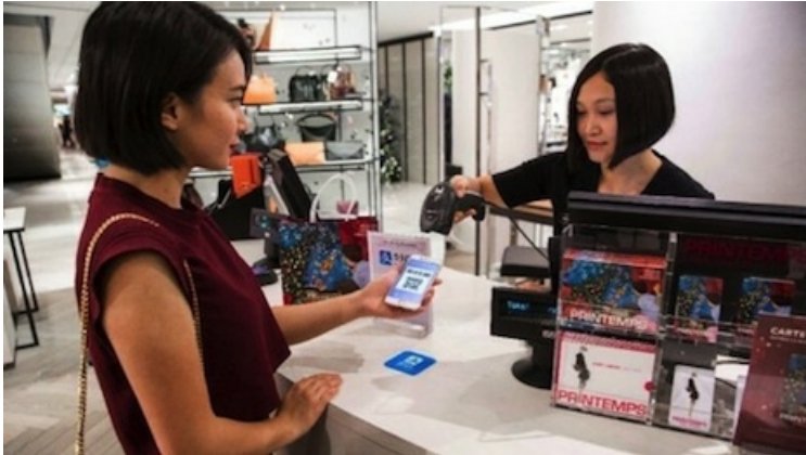
Paying in stores is changing.