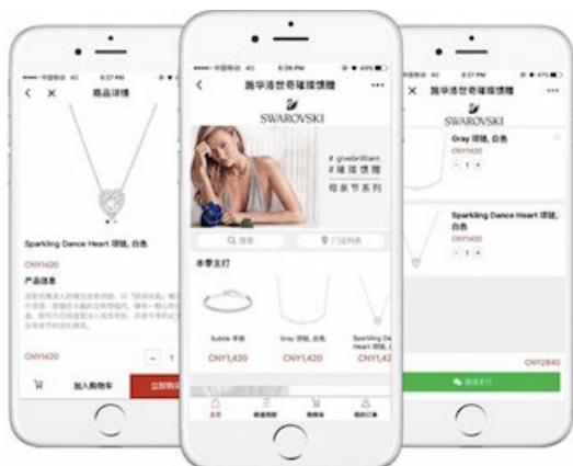
WeChat Pay is usable with a variety of luxury brands in North America.

"This adoption growth has also been propelled by payment gateways and processors who are now able to provide support for these tenders at checkout almost out of the box," he said.